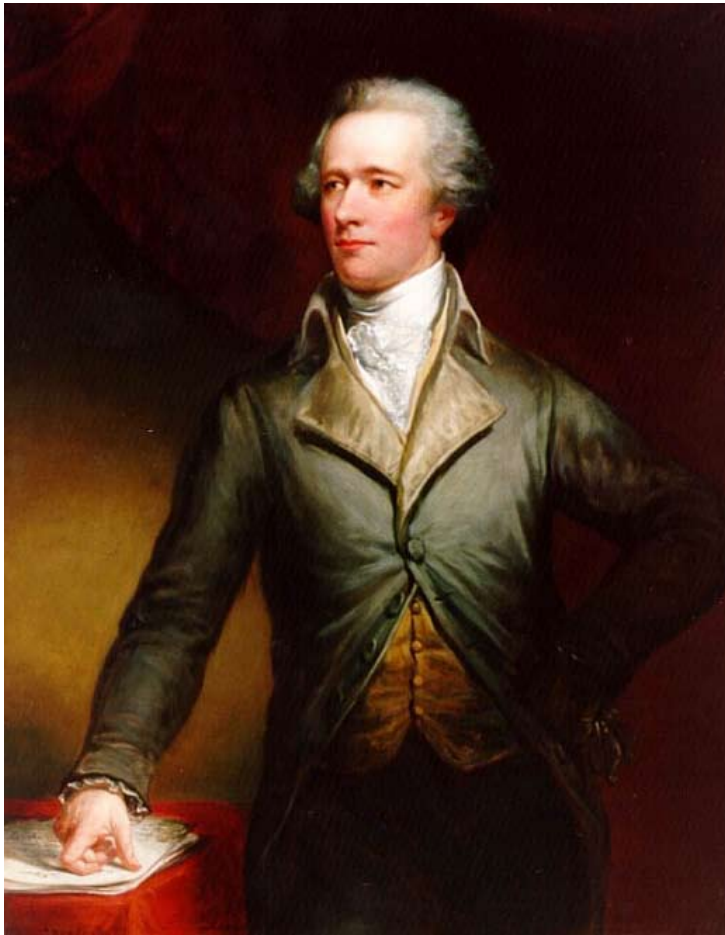
Only by shifting to a U.S.-based credit system, as established by our first Treasury Secretary Alexander Hamilton, and away from a monetary system, will it be possible to rescue the world's population from the onrushing New Dark Age. This portrait of Hamilton was painted by Daniel Huntington (1865).