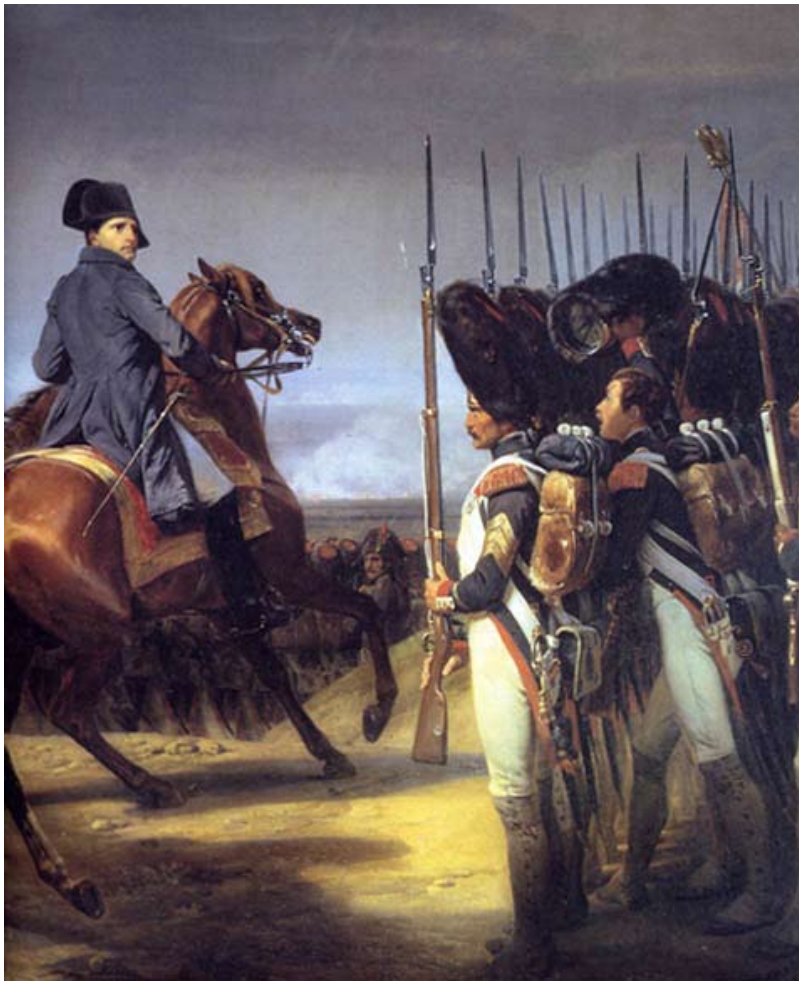
The Emperor Napoleon, shown here in a detail from "The Battle of Jena," by Horace Vernet, was a tool of the British Empire. His Seven Years War ruined Europe, allowing Britain to emerge triumphant in 1815, until the U.S.A., after 1876, checked its power.

Then, 1987: We had a recession which was as bad, or worse, than the Depression of 1929. And then we had a terrible man, Alan Greenspan, and what he came out of, that [Ayn Rand] cult he came out of, was not very good. The result was terrible.