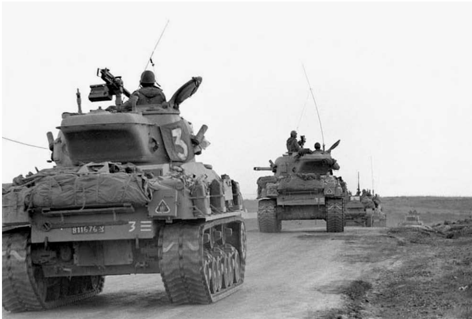
The so-called “Arab-Israeli” or “Arab-Jewish” conflict, is, in fact, one which has been played, from the outside, in our time, by the British Empire, whose intention is to control the vast oil resources of the region. Shown here: Israeli tanks advance in the Golan Heights, during the “Six-Day War,” June 1967.