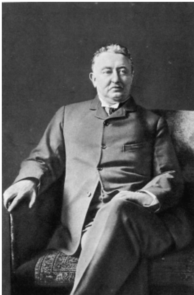
British imperialist Cecil Rhodes, founder of the British Roundtable, set out to establish institutions which would ensure that his white supremacist policies would outlive him.

After Lincoln’s victory over the Confederacy in the American Civil War, and even more so after the 1876 Centennial Celebration, it became clear that the United States could not be conquered militarily. The British responded by launching the pseudo-science of eugenics, and also the Round Table movements of Cecil Rhodes and Lord Alfred Milner. In the 1880s and 1890s, this elite movement created the Eugenics Society, founded by Sir Arthur Balfour of the Venetian-origin Cecil family; John Ruskin’s Pre-Raphaelite Brotherhood, opposing the entire European Renaissance; and the Round Table