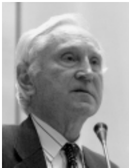
International Institute for Sustainable Development