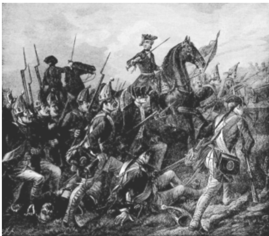
Frederick the Great leads his troops in the battle of Leuthen in 1757. "The notable feature, for our purposes here, of Frederick's victory at Leuthen, is the way in which Frederick, facing a professionally capable Austrian force nearly double his own troop strength, twice outflanked, and routed that enemy force on that day."

of the U.S. government by the utopians grouped around the "Southern Strategy" of Richard Nixon. Then came the destruction of global economic sanity by the successive steps of 1971-1972 toward destruction of the post-war monetary system.