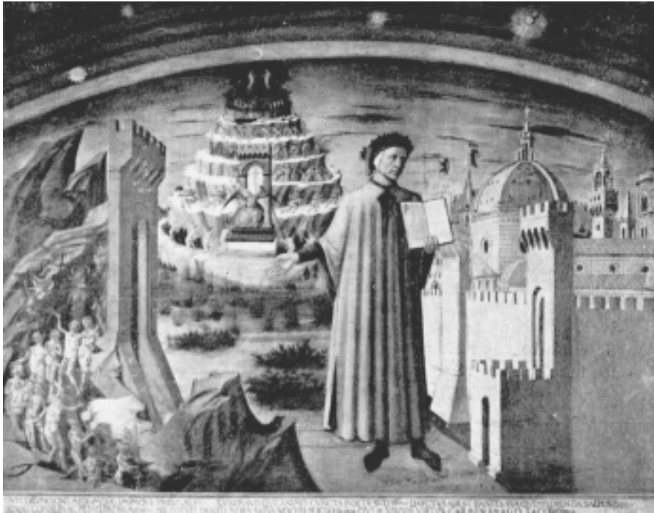
Michelino's 1460 painting of "Dante and His Poem" in "that Renaissance Florence where chapters of Dante's Commedia were teaching the Fifteenth-Century population of that city an exquisite literacy each week. . . . Filippo Brunelleschi's completion of the cupola of the Cathedral of Florence and the convening of the great ecumenical Council of 1439 there, mark the belated emergence of modern European civilization from the preceding, seemingly cyclical nightmares of ancient and medieval history."

reflect. Therefore, truth is not shown to us in the form of sense-perceptions, but only in the individual human mind's ability to adduce certain experimentally verifiable universal physical principles which are reflected, as knowledge, through anomalies which reveal the essential ontological quality of falseness of sense-perception per se . Kepler's initial discovery of a principle of universal gravitation, from assessing an anomalous feature of the observed Mars orbit, is a classical example of this arrangement.