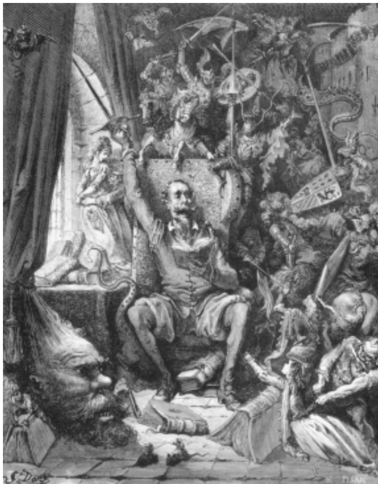
"Despite the bitterness which the sight of such lunacy as Spain's Sixteenth-Century ruling culture, might be expected to provoke in a patriot disgusted with the decadence of his nation's people, Cervantes' Don Quixote is a Sublime work, in which Cervantes looks at the folly of that Spain through observing the ironical eyes and mind of his witness, the Moor." Above: Gustave Dorés illustration of Don Quixote, "inflamed by romances of chivalry."

So, Cervantes' characters are specific to Spain of that time; but, the viruses of old diseases, although evolved, affect the susceptible of today to similar, or worse degree. Look, thus, at the France of Cervantes' predecessor, Rabelais, not overlooking the depraved madness of the reign of Henry II, or the England of sex-crazed Henry VIII, or the madness of the duped Elizabeth I in such follies as her role in the Essex affair which cleared the way for the alien Paolo Sarpi's take-over of England through such assets as the brutish and infinitely corrupt Sir Francis Bacon and the Orwellian Thomas Hobbes.