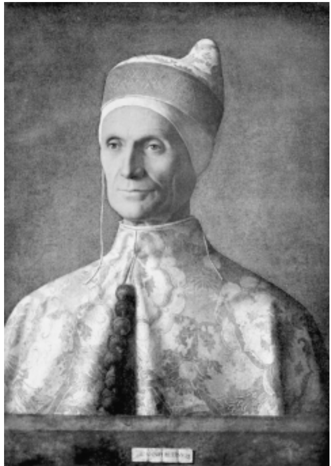
The 15th-Century Venetian Doge Loredan, painted by Giovanni Bellini (1504). “By means of an act of high treachery within the alliance of a modern Europe against the medieval evil of Venice’s financier oligarchy’s rule, the League of Cambrai was broken up. Thus, from 1511 on, Venice deployed the Inquisition-wracked tyranny of Spain as Venice’s chief instrument.”

Hence, it is foolishness indeed, to attempt merely to comment upon, or, worse, interpret, the great Classical works such as those of Dante and Petrarch, or of the great modern spirits of troubled times such as Erasmus, More, Rabelais, Cervantes, Marlowe, and Shakespeare. Or, in the same vein, the work of Bach, Haydn, Mozart, Beethoven, Schubert, Mendelssohn, Schumann, and Brahms. Art and science are not affected garments, to be worn by monkeys; they are mere uniforms of rank, which bring ridicule upon the rank itself, when the wearer lacks the essential distinctions of a suitable human soul. Otherwise, the putatively learned scholarship proves to be pretentious gibberish in the end. As Jonathan Swift said, in various ways: at the grammarians’ funerals, the pedants practice the art of saying many more or less learned phases, about many things, as comments, about matters of which they know essentially nothing. Yet, they say less than nothing,