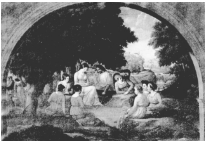
"At that time, the Black Death was scything hecatombs of the richest and poor of [Florence] alike. Boccaccio painted an echo of the wicked past, the present self-inflicted punishment, and, implicitly, an ironically contradictory future of that city." Above: an illustration from Boccaccio's Decameron.

requirements of those two contextual considerations, is fraud; is sophistry in the tradition of those Eleatics exposed by Plato's Parmenides dialogue.