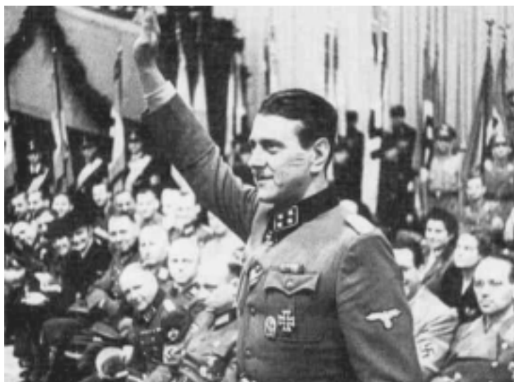
"These right-wing Anglo-American circles adopted and protected a hard-core of the Nazi security apparatus, including the husband of Hjalmar Schacht's niece, Otto 'Scarface' Skorzeny (above). . . . This is the network which orchestrated the so-called 'Strategy of Tension' throughout Europe during the 1969-1980 interval (the 1980 Bologna train bombing, left); and also, still later, throughout Central and South America."

of warfare, religious warfare, which endured until the 1648 Treaty of Westphalia.