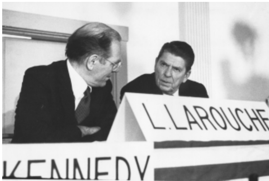
"I had warned the Soviet government's representatives in the back-channel discussions of February 1982, that rejection of President Reagan's [SDI] proffer, should he make it, would mean that the Soviet economy would disintegrate within about five years. It required six years." Above: presidential candidates Lyndon LaRouche and Ronald Reagan at an event in Nashua, N.H., 1980.

Relying on his confidence in not only the quality of his troops and their commanders, but relying also on his certainty of their confidence in him, he deployed them abruptly, in a