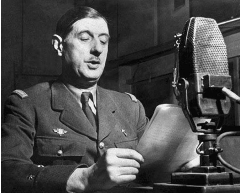
One of history's great ironies: de Gaulle, hated by Churchill and the British, worked from England, during World War II, under British protection. "We are at a moment of history where these ironies are coming back on the stage," Cheminade declared. Shown: Gen. Charles de Gaulle, addressing the French nation from Britain, 1943.

to us, in the form of America as such. It's coming to us in the form of America, as the ideas of the Founding Fathers—and, in the form of the work of our organization, I was mentioning, inspired by what Lyn has accomplished during his life against the British Empire.