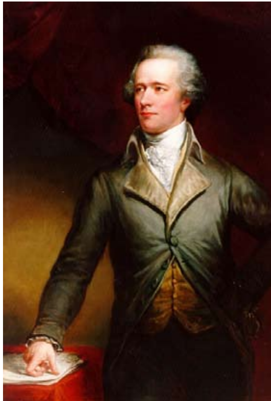
The American System of political economy was de facto established by the first U.S. Treasury Secretary, Alexander Hamilton, who established the principle of government responsibility for providing for basic economic infrastructure, and promoting scientific and technological progress. Here, Hamilton in an oil portrait by Daniel Huntington (1865).

Protective Federal regulation of foreign and interstate commerce, a Federal government monopoly respecting the issuance and regulation of legal tender, a centralized common defense under Federal authority, the promotion of public works