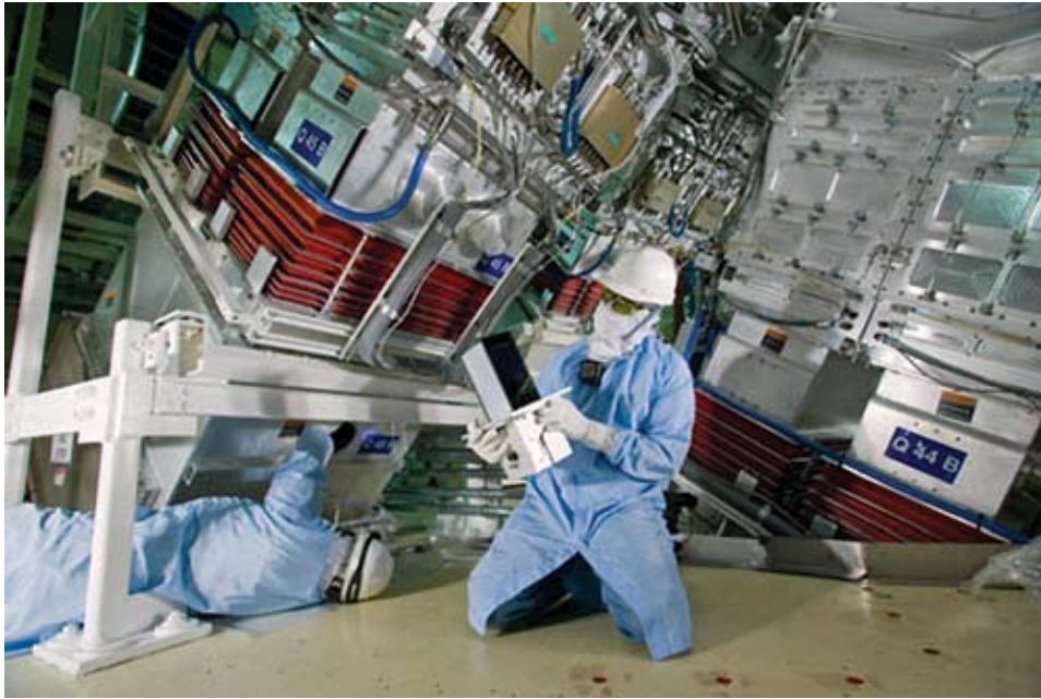
Lawrence Livermore National Laboratory

The development of nuclear fusion power is a key component of the breakthroughs that can be anticipated from revolution in science and technology that will come from the space and SDI program. Here, technicians at the National Ignition Facility, installing a replaceable unit.