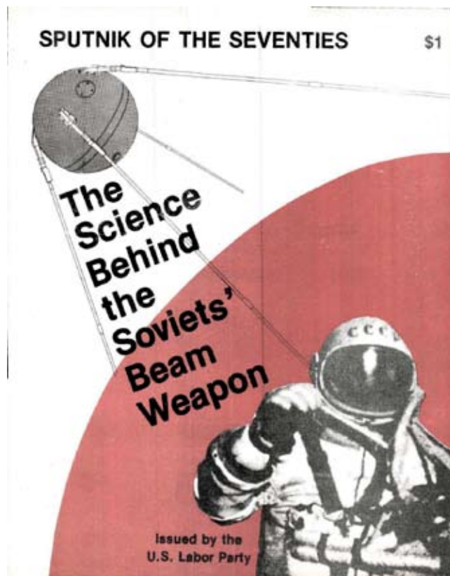
Having been made aware of the Trilateral Commission's policy of provoking war against the Soviet Union, LaRouche began campaigning for beam defense as early as 1977. Here, the cover of a pamphlet issued by LaRouche's U.S. Labor Party.