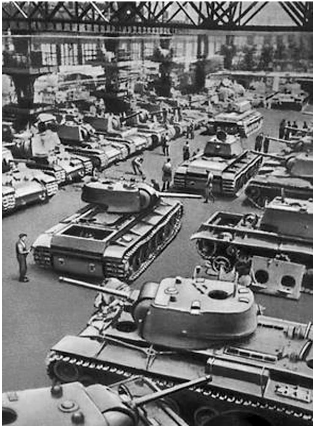
While the Soviet Union created a highly developed military industry, its failure to invest in basic economic infrastructure crippled the development of its economy, compared to the West. Here, a Soviet tank factory during World War II.

forms of life, is the quality of cognition : the ability of the individual human mind to create valid, revolutionary changes in axiomatic principles of human control over nature, by means of which the potential relative population-density of society is increased. This gain is reflected not only in an increase of the size and density of the human population, but also rises in individual life-expectancy, lowering of rates of sicknesses by age-interval group, and increases in both the “market basket” of household consumption and in the per-capita production of the contents of those household market-baskets.