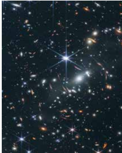
We have to think about expanding into the universe at large. Shown: an image of Galaxy Cluster SMACS 0723, taken by the James Webb Space Telescope, July 7, 2022.

Obviously, each of us is mortal. We are born, and we die. And in the short span between these two occurrences, most people are wasting it, because, before they even get to the idea that they could contribute something lasting with their life, they become old and senile, and they have missed the opportunity to do so. But the reality is, that once you understand that our identity as human beings is not limited to our biological existence, but that when we truly develop our creative potential and contribute some knowledge to the existing body of knowledge of mankind as a whole, and in this way increase the ability of mankind to have a durable existence, this exists even after we are dead. In this way, we are creating immortal ideas in science, in art, that