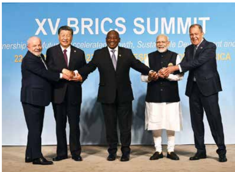
Government of India

So, therefore, what then happened is that the Global South became stronger and stronger; the countries of the BRICS—Brazil, Russia, India, China, and South Africa—became more active. Eventually, at the end of last year, in the BRICS summit in Johannesburg, they decided to become the BRICS+. From January 1st of this year, it's the BRICS-10. Ethiopia, Egypt, Saudi Arabia (which is in the process of becoming a