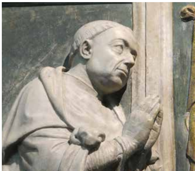
Relief of Cardinal Nicolas of Cusa (1401–1464), part of his memorial in the Basilica di San Pietro in Vincoli, Rome, Italy.

That is not just a slogan. I believe that as we see the tendency of the Global Majority becoming more prominent, we are also in an era in which, while sovereignty is extremely important and will be important for