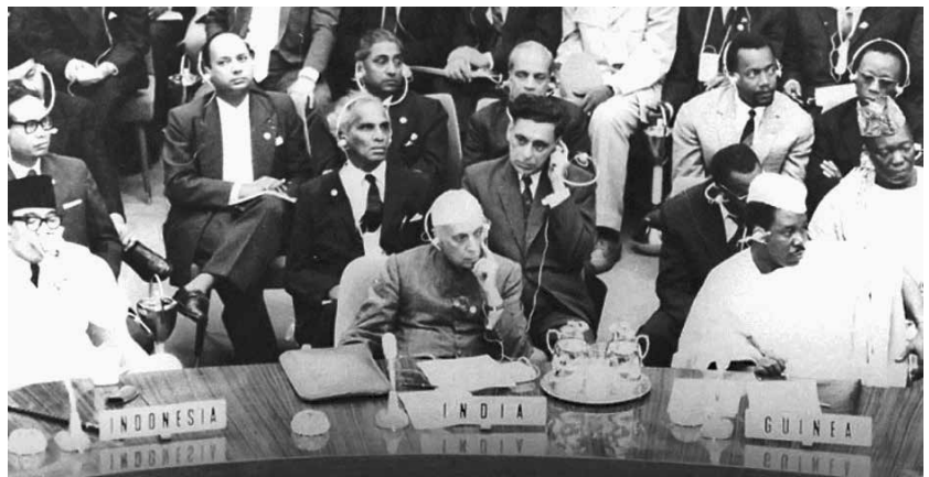
In the “Spirit of Bandung” from 1955, and encouraged by China’s offers of low-interest credit, countries of the Global South today are shedding the vestiges of 600 years of colonial oppression.

The spirit of Bandung, the first Afro-Asian conference of 1955, came back with a vengeance, one can say. The countries of the Global South more and more were being encouraged by China, because they had for the first time an alternative for development. For all these years before, the West had not given them credit to build infrastructure. Why did the Europeans not, in the years after the Second World War, give them long-term, low-interest credits to build infrastructure—ports, railways, industrial parks? They did not. Instead, they had the IMF conditionalities, which meant that the so-