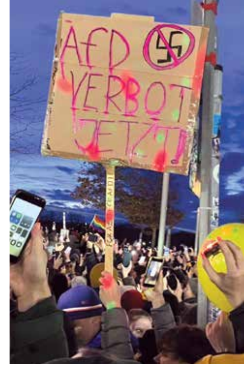
X/Kate Connolly@connollyberlin The AfD party's anti-Islam, anti-immigration policies sparked a week of demos across Germany, drawing the public away from the farmers' legitimate protests. The sign reads: "Ban AfD Now!" Berlin, Jan. 21, 2024.

Schlanger: Helga we have a couple of questions about the confrontation, or the pending confrontation, so-called, with Russia. From London, we have this: "With elections coming up in Russia in March, isn't it likely that the West will launch some kind of false-flag provocation to destabilize Russia