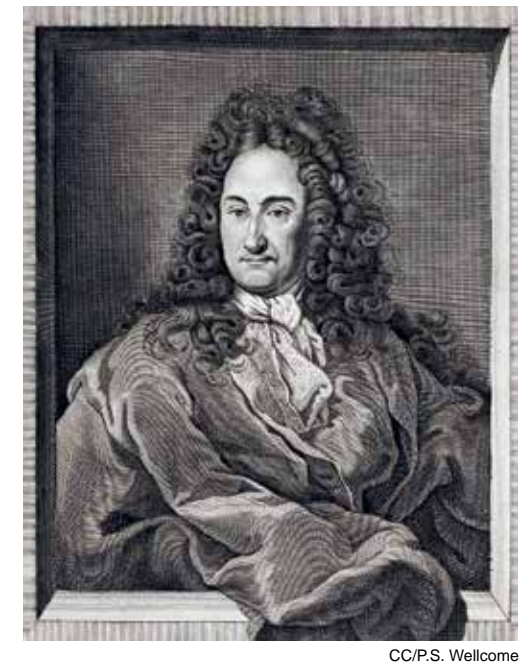
Gottfried Wilhelm Leibniz. His influence is clearly present in the U.S. Declaration of Independence and Constitution.

This was not what Voltaire tried to make out of it, as a sarcastic attack. What Leibniz meant is simply that