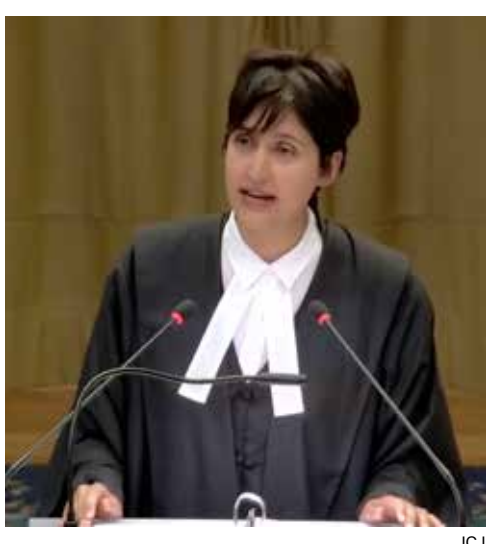
Dr. Adila Hassim, SC, former acting judge on South Africa's High Court, presented the case that Israel's war on Gaza has featured "acts which are capable of falling within the Geneva Convention against Genocide," to show that provisional measures by the Court are warranted.

Israel has deliberately imposed conditions in Gaza that cannot sustain life, and are calculated to bring about its physical destruction.