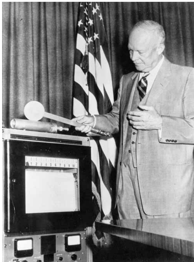
President Eisenhower symbolically starts up the first U.S. commercial nuclear power plant at Shippingport, Pa., in 1954.

One of the key areas of nuclear development that has been largely ignored during the recent decades has been the development of small modular nuclear reactors (SMRs), a technology which would rejuvenate the