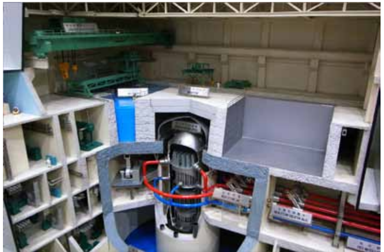
Model of the Toshiba ABWR, which became the first operational Generation III reactor in 1996.

Gen III nuclear reactors are essentially improved Gen II reactors. These improvements in Gen III reactor technology are aimed to extend the operational life to 60 years, potentially to greatly exceed 60 years, prior to com-