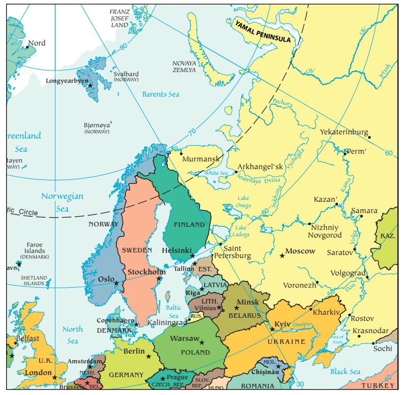
Russia is building a Northern Latitude Railway to connect the Yamal Peninsula within the Arctic Circle (dashed circle) to the region of the Ural Mountains to the south (mountains not shown). China's Poly Group is planning a deep water port and a southward rail connection in the Arkhangelsk region, just south of the Arctic Circle.

Northern Sea Route, and in the further study and exploration of the Arctic. I am counting on the successful launch of new, promising, large-scale projects with our French, Chinese, and foreign partners, as well as on our growing cooperation in the extremely rich Arctic Region."