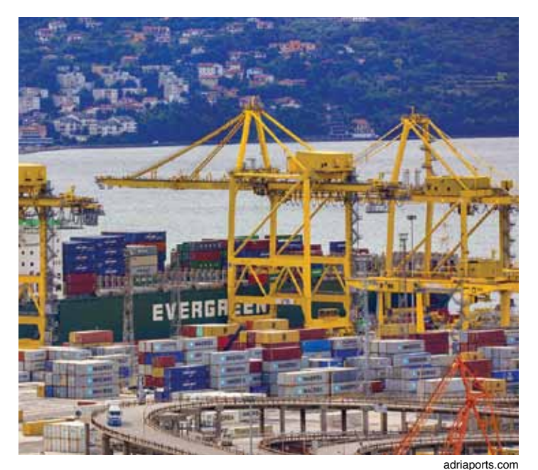
China is partnering in the upgrading of the port of Trieste to develop North Adriatic ports as the western terminal of the Maritime Silk Road.

tectionism and power politics." He reports that the Chinese are building a rail connection linking Serbia with the South Adriatic along the eastern shore of the Adriatic to Greece. In addition, the construction of the Belgrade-Budapest High-Speed Railway, which has been stalled by EU interference, will start in November. "It will be the biggest construction undertaking in the whole of Europe," he writes.