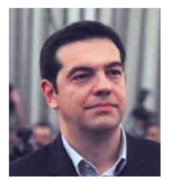
primeminister.gr Greek Prime Minister Alexis Tsipras

tectionism and power politics." He reports that the Chinese are building a rail connection linking Serbia with the South Adriatic along the eastern shore of the Adriatic to Greece. In addition, the construction of the Belgrade-Budapest High-Speed Railway, which has been stalled by EU interference, will start in November. "It will be the biggest construction undertaking in the whole of Europe," he writes.