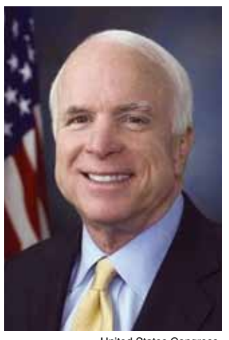
United States Congress John McCain

At first glance, it seems self-evident that the core of the "get-Trump" apparatus is the right-wing "neo-conservative" crowd, or perhaps—as they are often re-