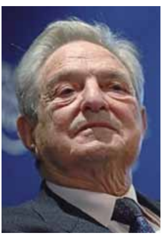
George Soros

April 7, 2017 EIR Mission Countdown 2017 37