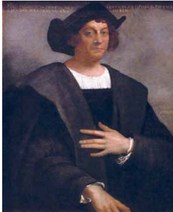
A portrait said to be of Christopher Columbus, by Sebastiano del Piombo.