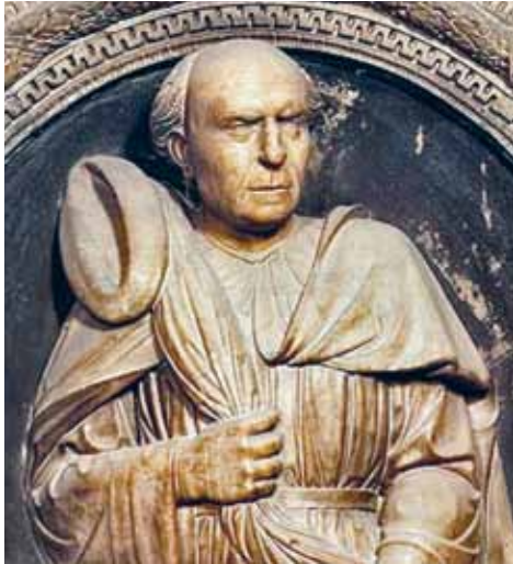
Filippo Brunelleschi (1377-1446)