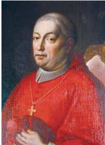
Nicholas of Cusa (1401-1464)