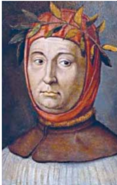
Francesco Petrarca (Petrarch) (1304-1374)

This mission was expressed in a letter by Petrarca [1304-1374] to the doges of Genoa and Venice, calling on them to stop their fraternal wars and seek peace through discovery of the oceans. And that's why I chose this aria, which was picked up in Verdi's opera. Francesco Maria Piave wrote the libretto explicitly referencing Petrarca's letter, and you can see it in this scene—it's wonderful when Cappuccilli says, "While the broad reign of the oceans ecstatically invites you. . ." ( Mentre v'invita estatico / Il regno ampio dei mari. . . )