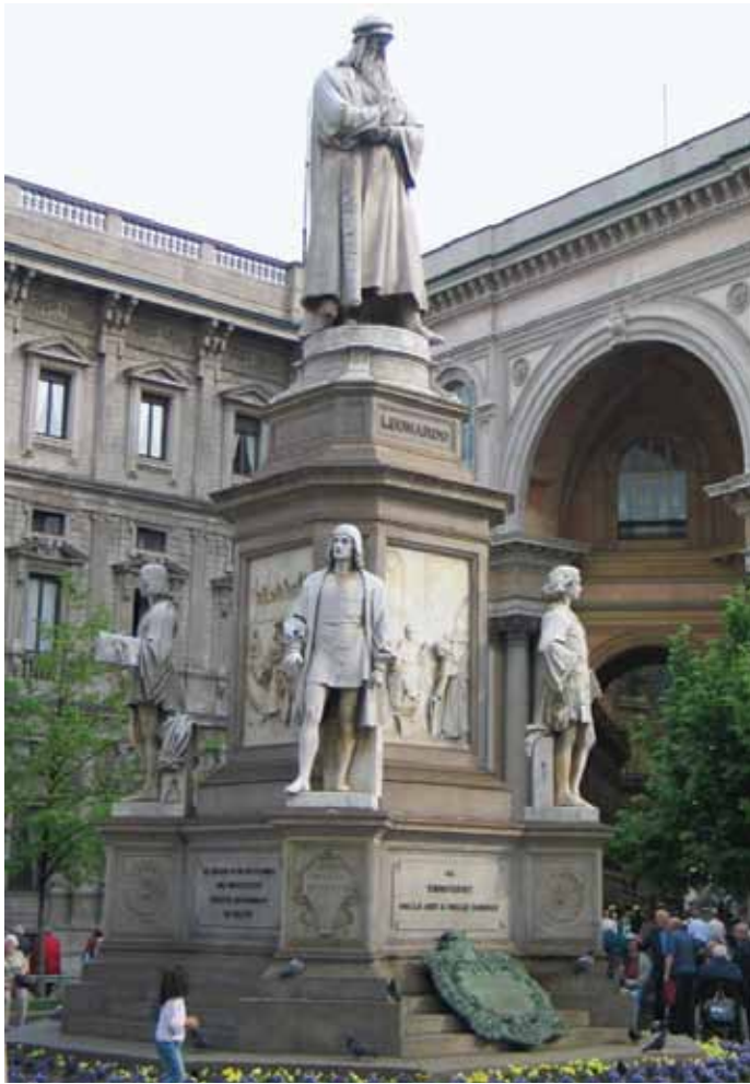
Statue of Leonardo da Vinci in Milan, Italy. Sculpture by Pietro Magni (1817-1877).

letter saying, “they understand each word I say to the contrary.” He was arrested because he studied anatomy, he studied corpses, in order to examine the vocal cords, and he was studying the propagation of the voice, comparing it to the propagation of light and water waves. That’s how he found that the voice which is well-placed, impostata , can reach out a great distance, while the voice which is not well-placed, not impostata , “is like a thousand flies,” he wrote; a thousand flies, he said, cannot make enough noise to be heard, while a well-placed voice can.