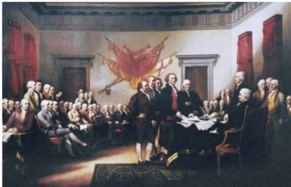
Signing of the U.S. Declaration of Independence.

That goes far afield from what we have to talk about here, but the relevant element is this. In 1982, a top secret letter was sent from the British government to the FBI, and that letter involved us. Now that letter is still classified. We still don't know what it says. But the FBI then responded to that British Intelligence letter and said that we would like to reiterate our conclusion that despite many of the "harassment" activities of the NCLC (that was the name of LaRouche's organization