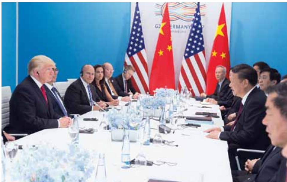
President Donald Trump and President Xi Jinping at the G20 Summit in Hamburg, Germany, July 9, 2017.

We have said the whole time that given the fact that Congress is what it is—the neo-cons in the Republican Party are what they are—that only a bipartisan coalition implementing the Four Laws of Mr. LaRouche—Glass-Steagall, a national bank, a credit system—would provide the kind of financing necessary for the reconstruction not only of Puerto Rico, but of the entire United States. We have also said all along that, given the strategic environment, the only thing that makes sense is for the United States to take up the offer of President Xi Jinping and join with the New Silk Road. And that the United States should allow Chinese investments in U.S. infrastructure, allowing the Chinese to invest their ap-