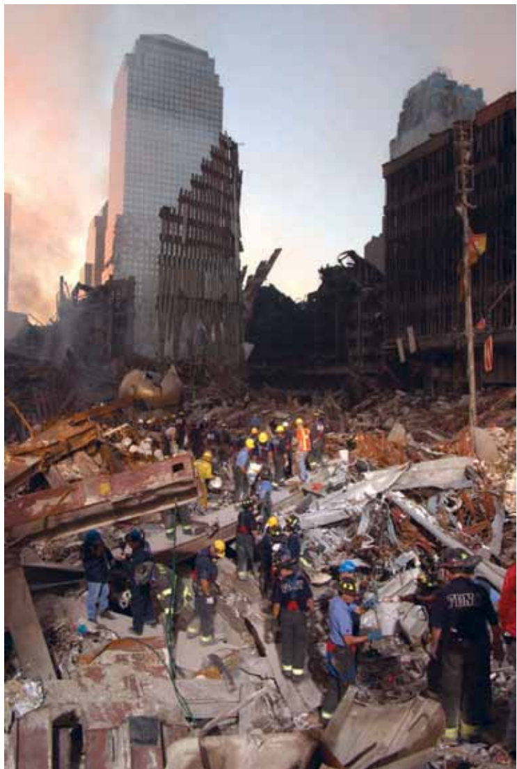
Firefighters and urban search and rescue teams work amidst the rubble of the collapsed World Trade Center in Manhattan, Sept. 16, 2001.