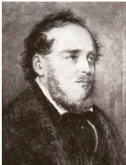
German-American economist Friedrich List

EIR: And my final question is—it seems to me, and you have more in-depth knowledge of it—that the history of German culture in the broad sense from Nicholas of Cusa and J.S. Bach, is central to Germany's role in solving the problems of humanity as a whole. It's something you've been occupied with for decades—I wonder if it's something you want to address in conclusion?