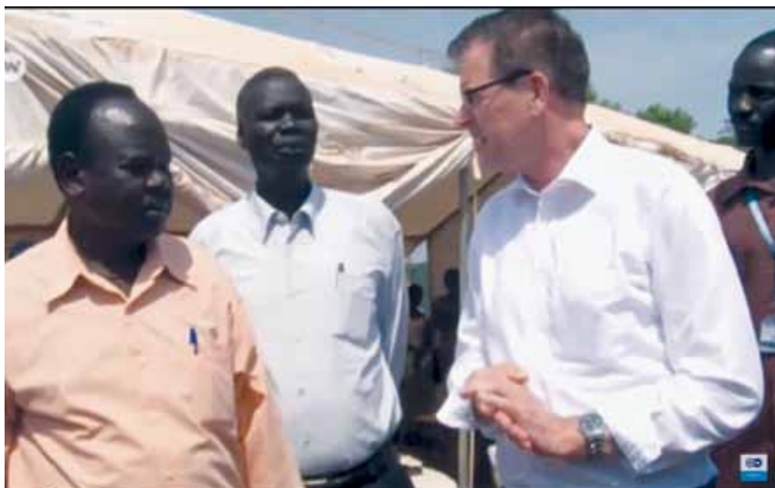
German Development Minister Gerd Müller at South Sudan refugee camp.

war-torn regions of the Middle East. I think that that would really put the world on a completely different trajectory, and would really change the world for the better right away.