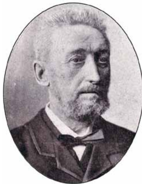
Wilhelm von Kardoff in 1903

Zepp-LaRouche: Germany used to be called in the past the country of poets, philosophers, and inventors. Unfortunately, that very rich tradition has been replaced for the most part by the axioms of globalization and every distortion of knowledge which goes along with that. But fortunately, this tradition can be rediscovered; there can be a renaissance of the ideas associated in science with Nicholas of Cusa, Kepler, Leibniz, Riemann, and Einstein. In music, the Classical tradition of Bach, Beethoven, Schumann, and if I may include the Austrian composers Mozart and Schubert, and also naturally Brahms, who have long ceased to be German, but have become part of world Classical music. And in poetry and drama, the tradition of Lessing, Mendelssohn, Schiller,—and I would like to add the brothers Wilhelm and Alexander von Humboldt, who had an image of man which was really the most noble humanist conception. The idea that every human being can become and develop a beautiful character. Schiller said that every human being can become a beautiful soul; and he defined only the person who has that characteristic to be a genius. So, with the Wilhelm von Humboldt education system, the idea that every human being can become a genius is exactly what is in reach if we reach this new epoch of mankind, which is already on the horizon.