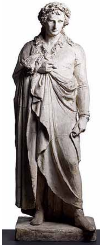
Statue of Friedrich Schiller, by Bertel Thorvaldsen, 1835

And I would maintain that that hope is based upon creating an aesthetical state of mind, freeing oneself from prejudices, freeing oneself from the conditions