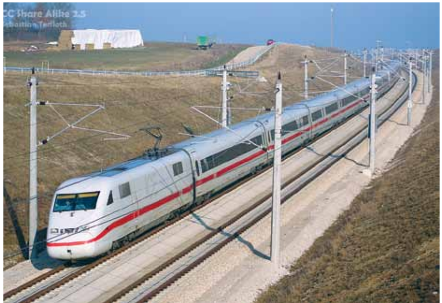
German high-speed rail: The first generation Intercity Express trains criss-cross the country, much like the TGV in France.

EIR: Since the election, your husband Lyndon La-