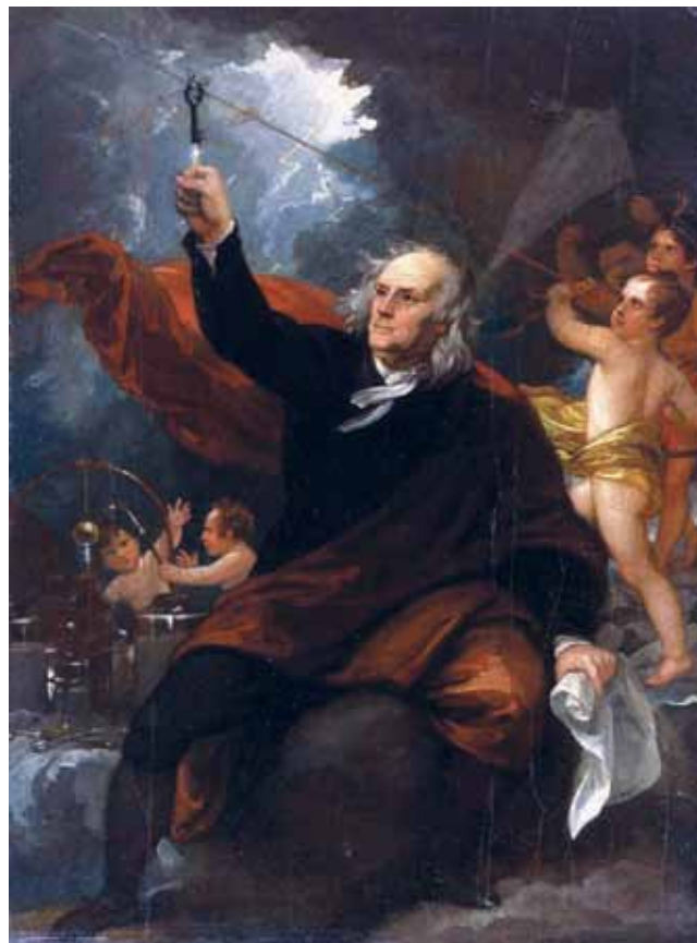
Philadelphia Museum of Art

Over two thousand years later, the name of Prometheus would once again inspire men to fight against the Gods of Olympus and harness fire. And no man deserved the title "The modern Prometheus" more than one of the great leaders of the American Revolution, Benjamin Franklin. This title was bestowed on Franklin by Anne-Robert-Jacques Turgot, a French economist and sometime supporter of the American Revolution. Franklin's role in the success of the American Revolution and the establishment of an American constitutional republic is legendary. So was his demonstration that lightning was another form of electricity. But Franklin himself is exemplary of the gifts of Prometheus.