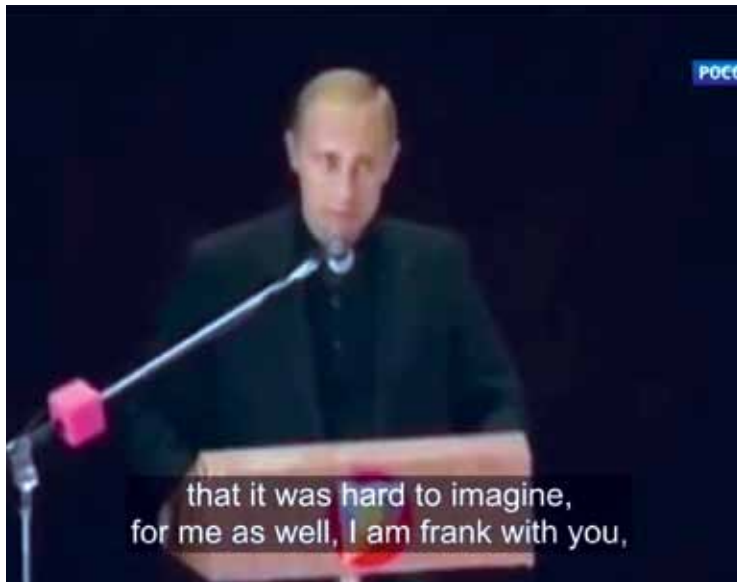
Russian State TV Putin faced six hours of questions and accusations from family members of the crew of the Kursk submarine, which exploded and sank in 2000, killing all 118 crewmen.