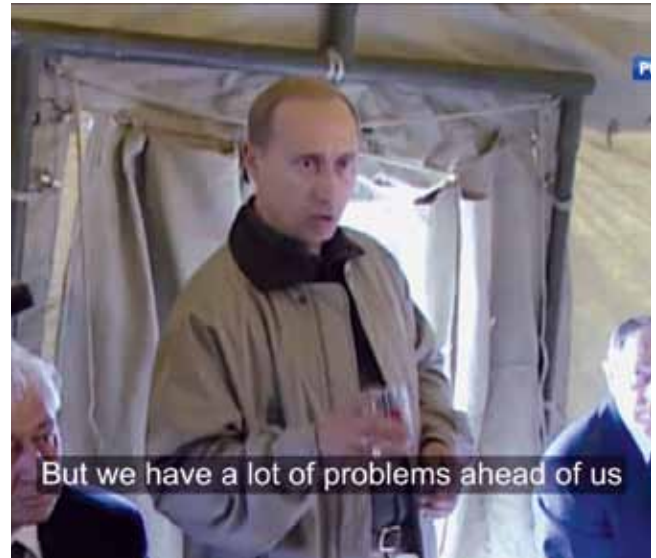
Russian State TV

In August 1999, after Chechnyan terrorists invaded the Russian province of Dagestan, Putin went to the front lines and delivered a legendary toast to military commanders, stating that he and they would not drink the vodka toast until the crucial task was completed.