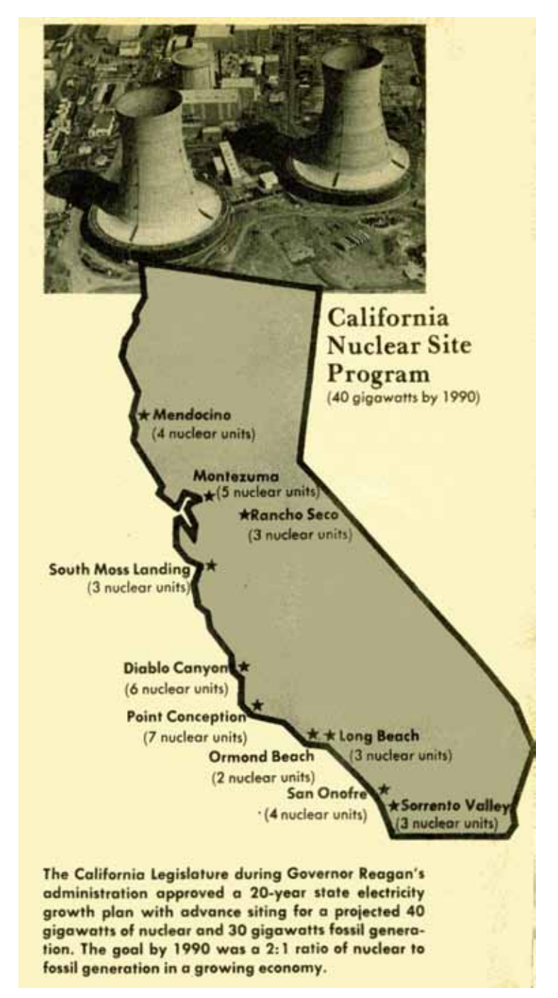
Legislature-approved electrical power generation sites, by the Wertz for Senate campaign in 1982.

Hitler regime murdered." LaRouche wrote that the issue in the 1982 Senate campaign "is whether or not the California Democrats have the moral fiber to repudiate Malthusian policies efficiently designed to murder a hundred times more