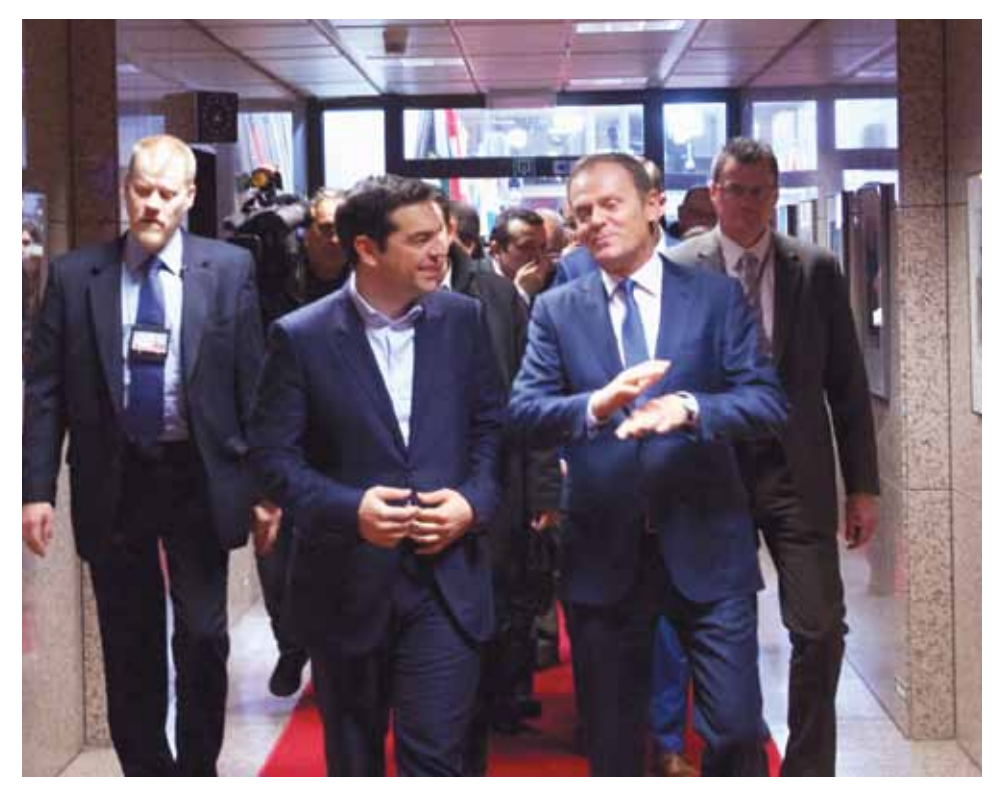
Greek Prime Minister Alexis Tsipras (left foreground) with European Council President Donald Tusk (of Poland), in Brussels on Feb. 4. Tsipras is calling for an international debt conference to deal with the unpayable debt of Greece and several other nations; the European Union is so far blocking the initiative.

ment in Greece more attractive so the country can meet its international obligations and return to prosperity." In conclusion, the Ambassador is quoted: "The United States believes that it is very important for the Greek government to work cooperatively with its European colleagues, as well as with the IMF." The message is clear: Greece must submit to its own self-destruction.