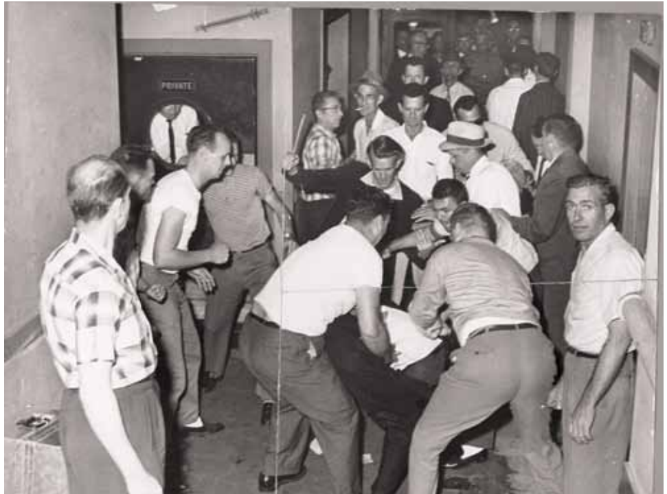
Federal Bureau of Investigation

As World War II broke out in Europe, President Roosevelt asked citizens and police to report sabotage