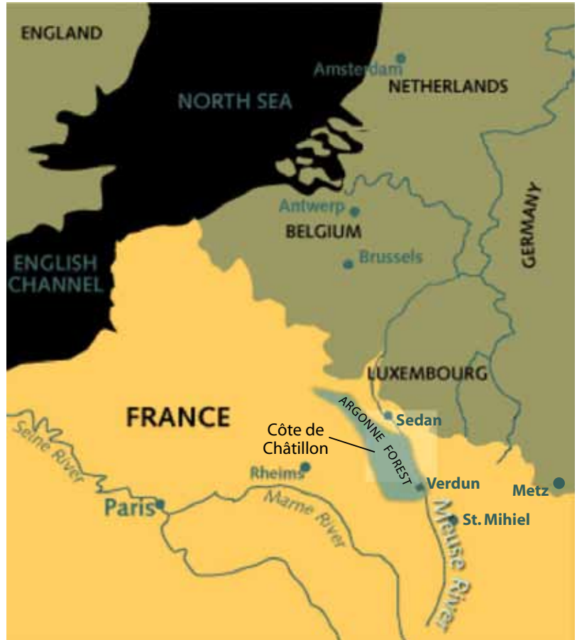
The lay of the land during the battle for the Argonne.

ble. His deep belt of entanglement and trench dribbled out at the ends. There was where I planned to strike with my Alabama cotton growers (the 167th Regiment) on the left, my Iowa farmers (168th Regiment) on the right. I planned to use every machine gun and artillery piece as covering fire.”