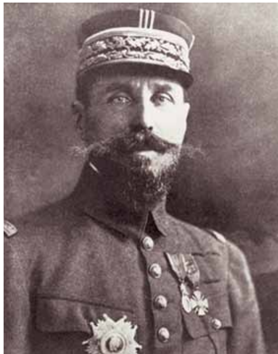
French General Henri Gouraud, considered by MacArthur to be “the greatest” of modern French commanders.