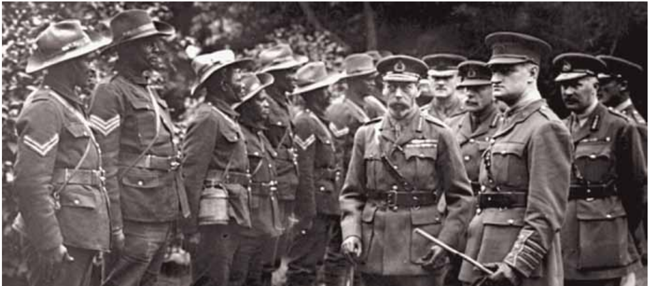
UK Official War photographs

King George V was “hands-on” during the War, seeking to put American troops under British command. Here he inspects members of the South Africa Native Labour Corps.