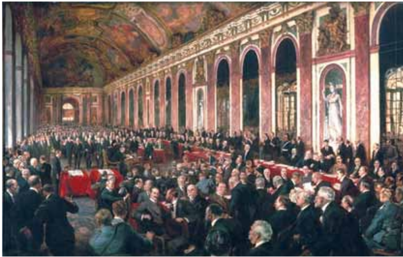
Australian War Memorial

The signing of the Treaty of Versailles, June 28, 1919, the signal for the beginning of the next war.