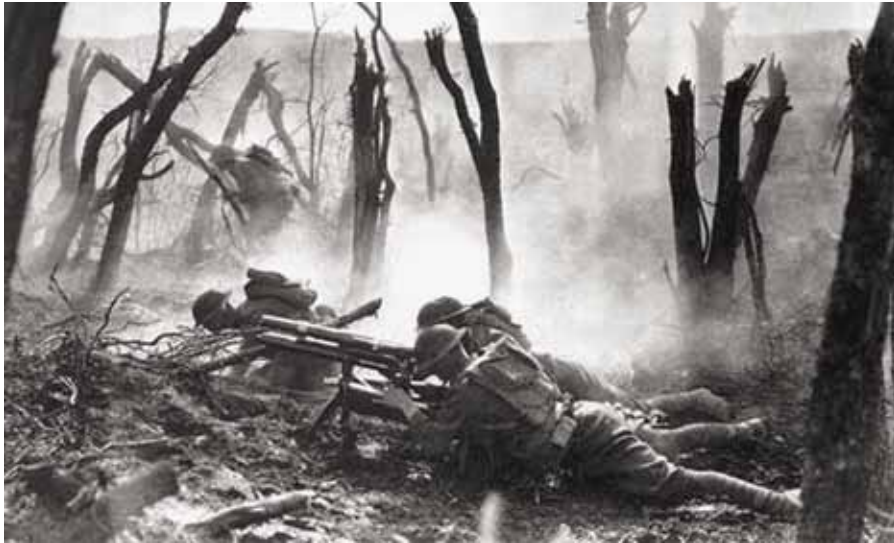
National Archives and Records Administration