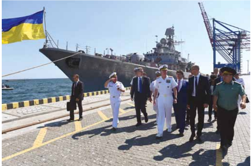
U.S. and Ukrainian officials at the kickoff of NATO's Sea Breeze-2015 maneuver in the Black Sea, September 1, 2015.

For example, you had King Abdullah II of Jordan; you had President el-Sisi of Egypt, who spent three days in Moscow, mostly meeting one on one with President Putin. And they worked a great deal on ideas for how to solve the problem of the Islamic State, and the instability that has not only triggered a crisis throughout the Middle East, but has resulted—along with the crisis in Libya—in waves of refugees seeking survival inside continental Europe; flooding an area that is already in profound economic crisis with a humanitarian crisis of severe proportions.