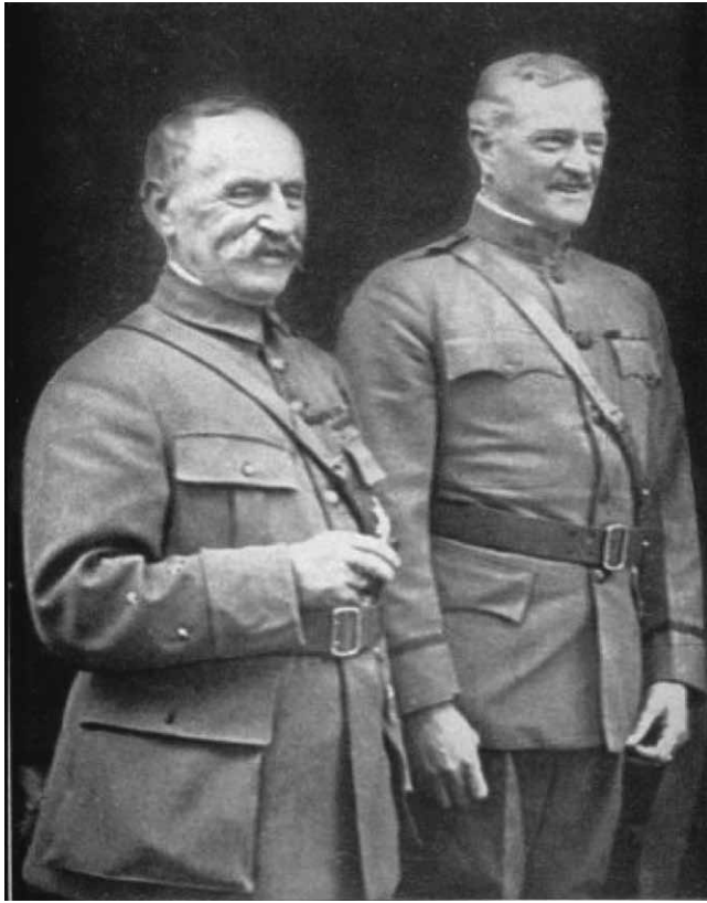
Major General John Pershing (right), head of the American Expeditionary Force, with French Marshal Ferdinand Foch, Commander-in-Chief of the Allied Armies in World War I, sometime in 1918.

Marshall Douglas Haig. Baker joined in that fight whenever necessary, and once told Lloyd George, who had “advised” Baker to put U.S. soldiers under British command: “If we want advice about who should command our armies, we would ask for it. But until then we do not want nor need it from anyone, least of all you.”