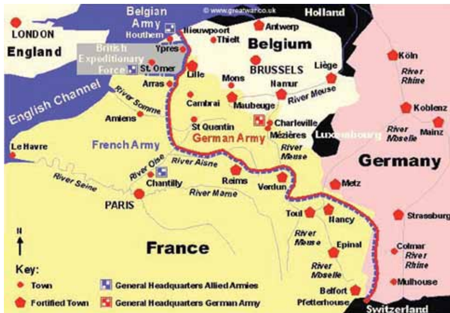
An overview of the battlefield on the Western Front, showing the battlefront between the German and Allied forces.

the west. A deep allied advance on this front and the seizure of the Longwy-Briey section would deprive the enemy an indisputable supply of ore for the manufacture of munitions. It might also lead to the invasion of enemy territory in the Moselle valley and endanger the supply of coal in the Saar basin. Allied success here would also cut his line of communications between the east and the west and compel his withdrawal from northern France or force his surrender.