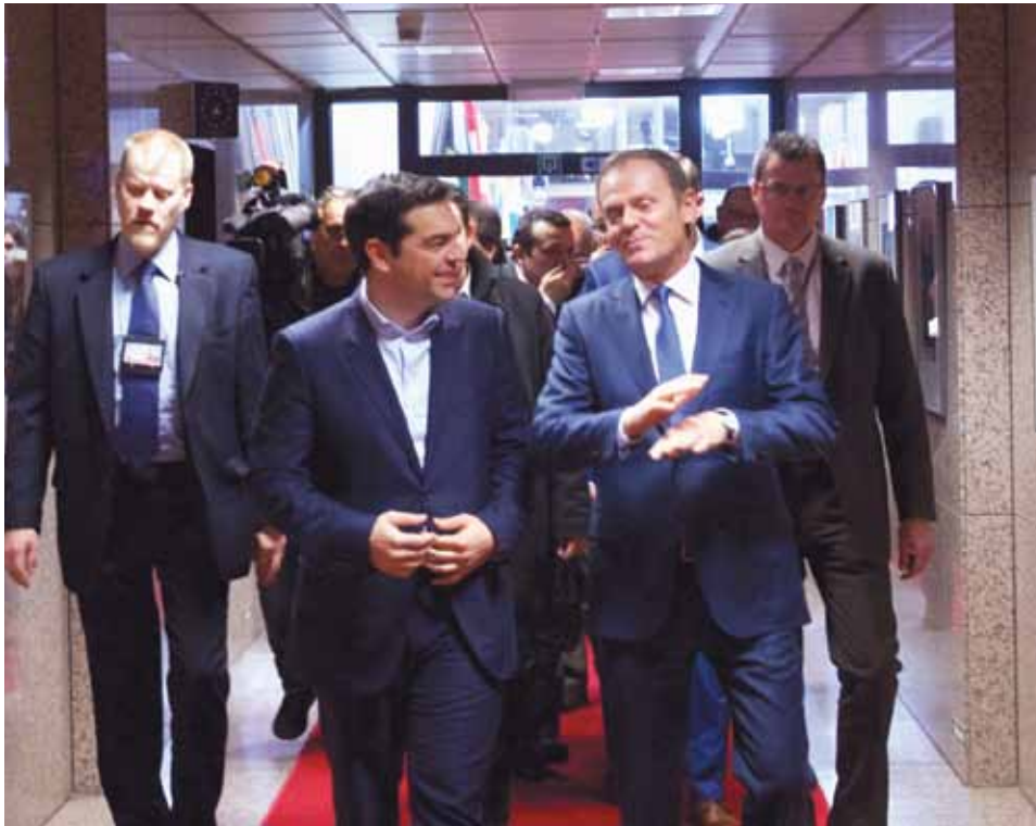
Greek Prime Minister Alexis Tsipras (left foreground) with European Council President Donald Tusk (of Poland), in Brussels on Feb. 4. Tsipras is calling for an international debt conference to deal with the unpayable debt of Greece and several other nations; the European Union is so far blocking the initiative.

ment in Greece more attractive so the country can meet its international obligations and return to prosperity.” In conclusion, the Ambassador is quoted: “The United States believes that it is very important for the Greek government to work cooperatively with its European colleagues, as well as with the IMF.” The message is clear: Greece must submit to its own self-destruction.