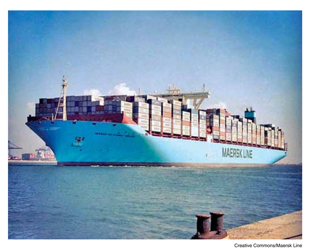
A huge Triple-E freighter passes Port Said in the Suez Canal.

The Trans-Mashreq High-Speed Railway is being built to the east of the canal and the Trans-Maghreb High-Speed Railway from the west.