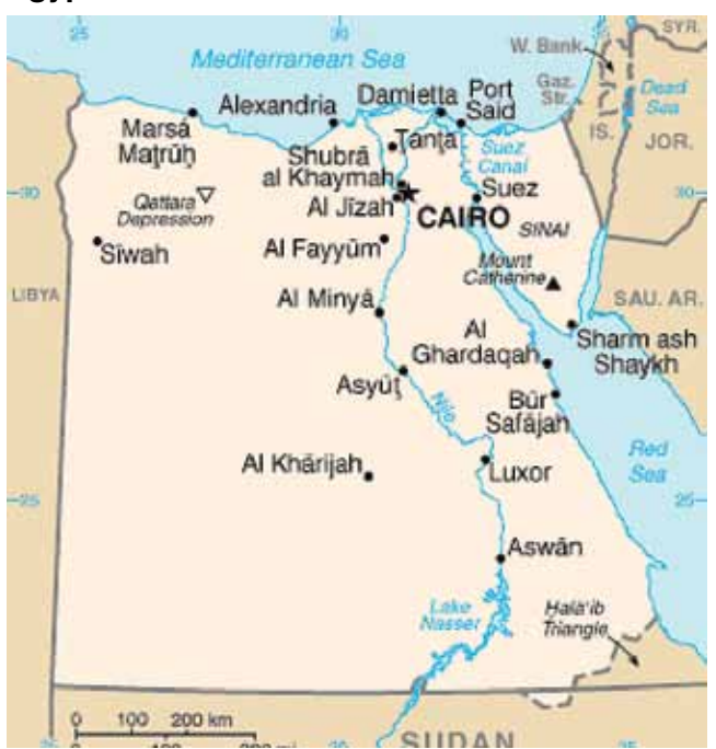
FIGURE 1 Egypt

The development of the war-ravaged Darfur province in Sudan, as well as South Sudan, will become an integral part of these projects.