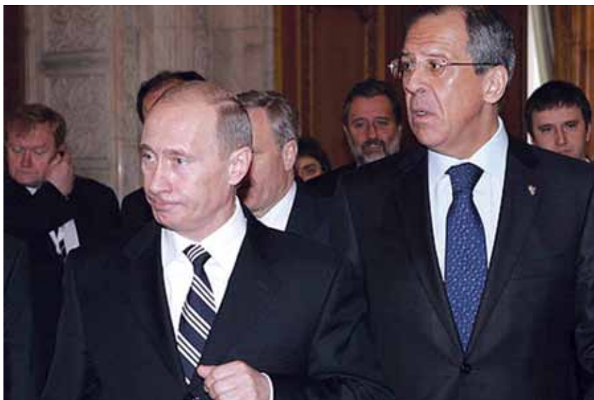
Presidential Press and Information Office

The Russian governments of Vladimir Putin, as either President or Prime Minister (beginning in 2000), have acted with this understanding, but consistently attempted to outflank Western assaults, including through offers of economic and security cooperation. Increasingly, however, the Russian leadership has found it nec-