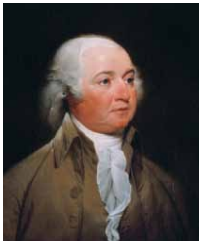
John Adams; portrait by John Trumbull (ca. 1792-93)