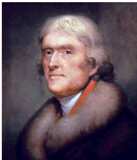
Thomas Jefferson; portrait by Rembrandt Peale (1805)