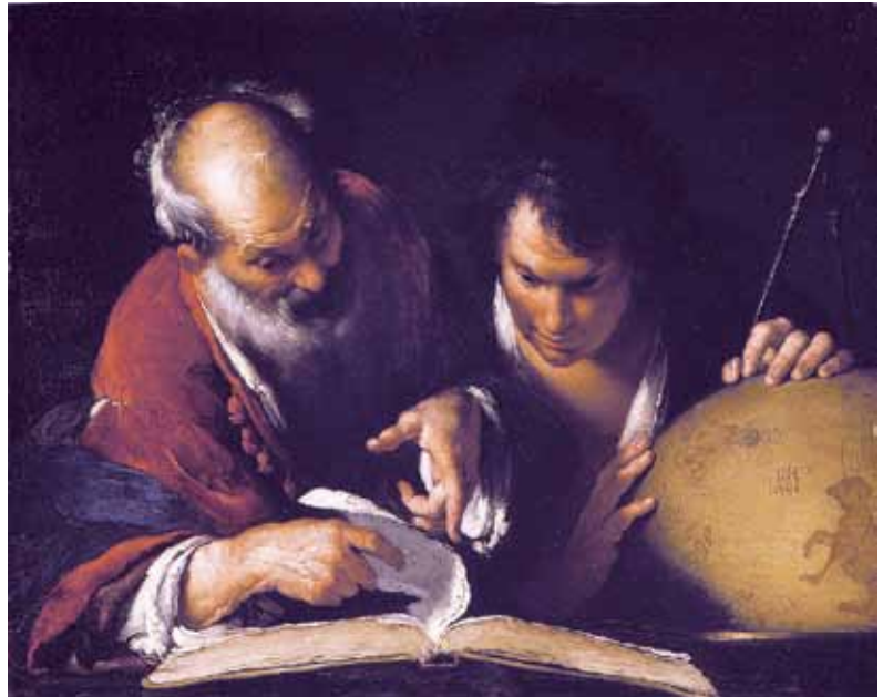
"What Eratosthenes accomplished in the measurement of Earth from the observation of the Sun, was a pathway of escape from the mere reductionist's prison of merely human sense-perceptual powers as such." "Eratosthenes Teaching in Alexandria," by Bernardo Strozzi (ca. 1635).

The particular significance of the point from history, is that what Eratosthenes accomplished in the measurement of Earth from the observation of the Sun, was a pathway of escape from the mere reductionist's prison of merely human sense-perceptual powers as such. The general principle was clearly established by the com-