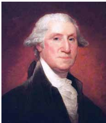
George Washington; portrait by Gilbert Stuart (1795)