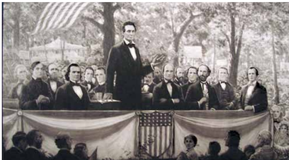
The British imperial influence, exerted through a combination of “states’ rights,” combined with the degradations of the Wall Street system, continues to undermine the sovereignty of the United States. Shown: the famous 1858 Lincoln-Douglas debates over the future of slavery in America, in which Lincoln defended the sovereignty of the Union, against Douglas’s defense of states’ rights.

The root of that corruption was expressed in the form of the fraudulent presumption of a “States Rights system,” which has been directly in opposition, as an exception to U.S. Federal Constitution. This has meant, in effect, a U.S. economy already dominated by the then, British-imperial system’s accumulated control