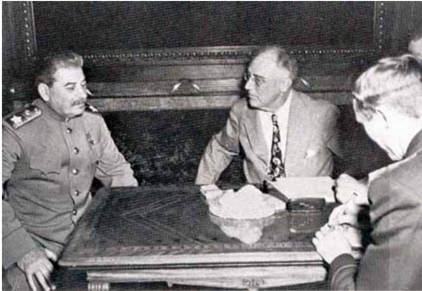
Discussions between FDR and Stalin (shown here at Yalta, 1945) had begun to lay the basis for international collaboration—but once the two leaders had died, the British Empire went to work to sabotage it, mostly successful until now.

effect what was called a “witch hunt” for the case of our United States.