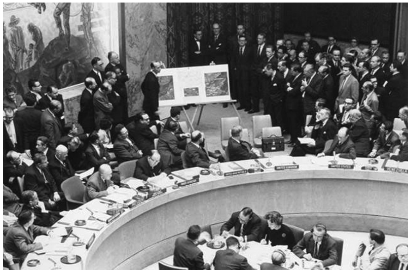
During the Cuban Missile Crisis of 1962, U.S. Ambassador to the United Nations Adlai Stevenson shows the Security Council aerial photos of Soviet nuclear weapons. A recent Voice of Russia radio broadcast warned that we are closer to nuclear war now than we were then.