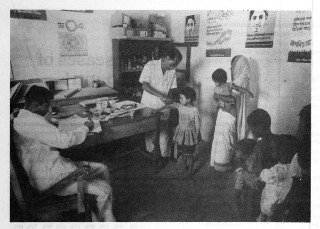
A village health clinic in Bangladesh during the 1970s. "If you don't spend money on public health, public health goes downhill. Public health is what has always kept people healthy. Epidemics throughout history have always been linked to a breakdown in public health."

graphical area, using different serologic techniques, because I don't think that you are just talking about neutralizing antibody activity, especially with the whole issue of enhancement. Studies on viral ultra structures [structures created by the virus itself within tissue] should be carried out.