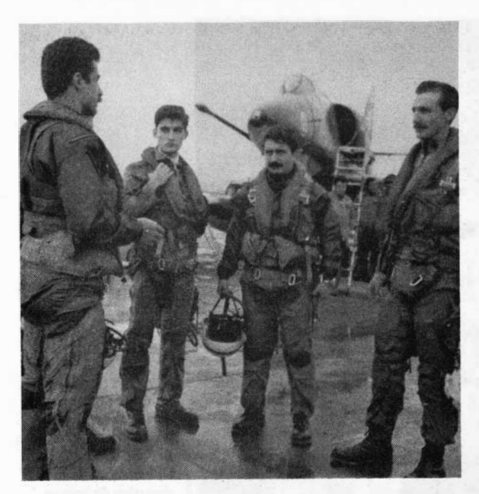
Argentina's "Cruz" air squadron prepares to leave on a mission during the Malvinas War. Today, a plan is afoot to dismantle the armed forces of all the nations of Ibero-America.

The "Panama case" is a clear indication of the intent of the current United States government: to completely eliminate any attempt to defend national sovereignty, especially if supported by national armed forces. While I pursued my military activities, I observed the concern of many United States authorities, and to learn their true intentions, I spoke with many U.S. military commanders, in hopes of avoiding what finally occurred: the invasion of Panama, a true disaster, a total injustice, and aberrant genocide. I still bear great sadness and pain in my heart over that fateful act, inconceivable in the civilized world in which we purport to live.