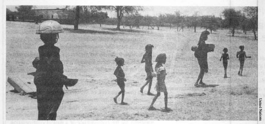
Refugees in the Sahelian zone of Niger, roaming in search of food and water. The United Nations does not even know how many of them there are, and the world's governments are cutting the budgets for the meager relief efforts that do exist.

these human beings into a dependence on the most savage, backward existence imaginable, mocks all environmentalist yearnings for "living off the land." Referring to the Itang vicinity, an Ethiopian relief worker commented, "Just five years ago, this entire area was so thickly forested you couldn't see from here to here." Hundreds of thousands of refugees have inundated the land, cutting down trees for fuel and denuding the landscape. For the first time ever, the region is experiencing extensive flooding during the rainy season. Wild animals native to the area have not been seen in years.