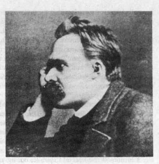
and it rather that there is shown

out a four-point program containing his call for a "greater German policy":