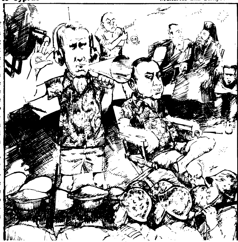
"Give it everything you've got — we want an epic greater than Northern Ireland!"

As purposefully inflammatory press reports and CIA news "leaks" keep tension high, these troops — trained in the divide-and-rule counterinsurgency for which the British are famous — will help NATO and the CIA exercise fingertip control over events in the eastern Mediterranean.