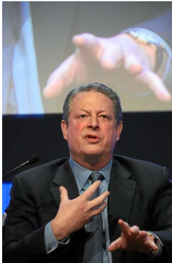
World Economic Forum

The Baby Boomers are not a generation; they are a fraction of a biological generation, chiefly from among those born during the immediate post-war interval 1945-1958, who, like their representative, and former Vice-President Al