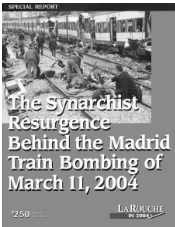
LaRouche in 2004

Beware of fallacies of composition, LaRouche says—a warning that also applied in the aftermath of the Madrid train bombing in March 2004. Here, the LaRouche 2004 Presidential campaign’s Special Report on “The Synarchist Resurgence” behind that bombing.