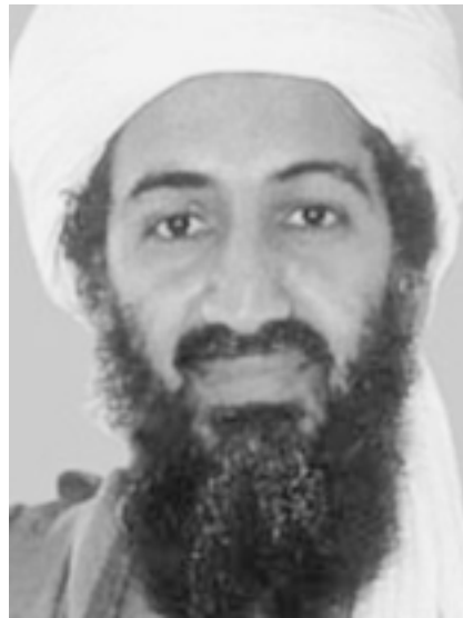
FBI Ten Most Wanted Fugitives list