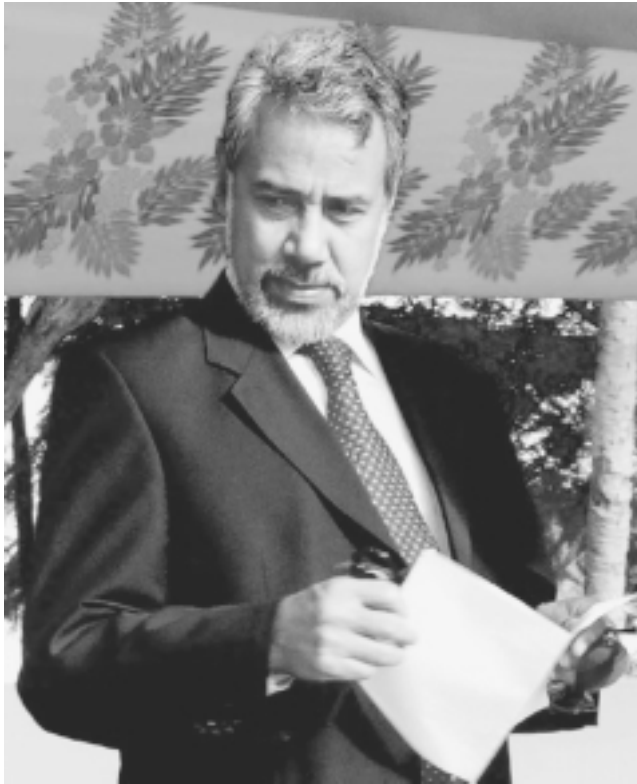
Xanana Gusmao, President of Timor Leste (East Timor), has shown his willingness to stand up to the most powerful of hostile forces, which are trying to use the new nation as a pawn in larger geopolitical conflicts.

effort, while also inviting those who had fled to return, face the courts if necessary, and either clear their names, or serve a jail term, and then join in rebuilding society.