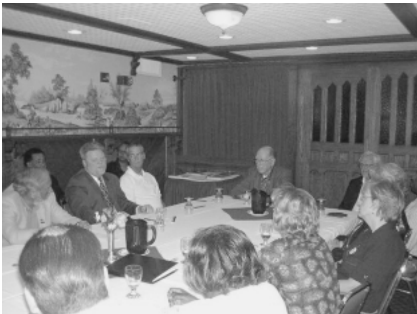
Candidate LaRouche met with the Louisville Building Trades Council's leaders for an hour on May 6, during his campaign swing through Kentucky and Arkansas. "Most people who are running for President," he told them, "tell you what they're going to do when they get there. Now, if they're not already doing it, as you may know, they generally don't do it when they get there."

Mississippi River, up to the 20-inch rainfall line out in the Midwest—this whole system, it's disintegrating. We started a system of water management. It was actually completed under Roosevelt, up to about St. Louis; and from there on down, we had a system, the TVA system. The attempt to get the TVA, the Tennessee-Tombigbee system, into operation, was an extension of that kind of system, of managing the existing water resources to deal with the problems.