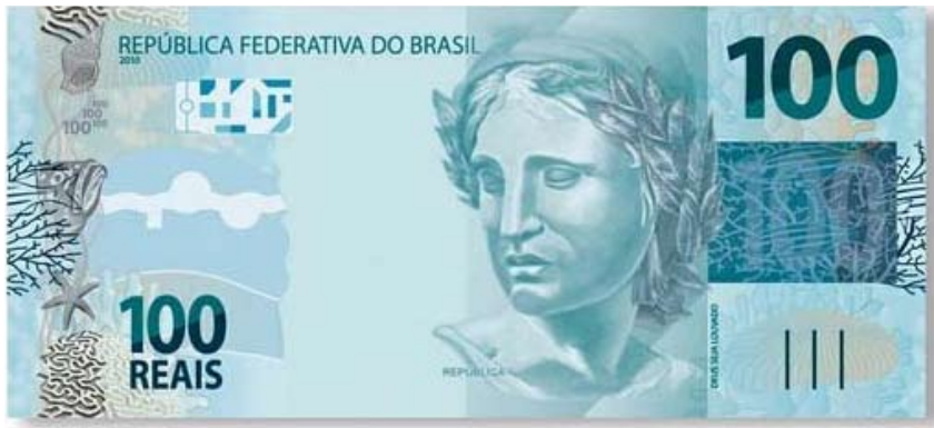
Brazil's currency, the real: The basis for the looting of the later carry trade was established by the 1994 Real Plan of President Fernando Henrique Cardoso.

heavily within Russia as representing a way for its members to be independent of the U.S. and European economies and finance. After all, Goldman Sachs is not exactly unknown in Russia, especially in connection with the looting of the Russian economy under the Yegor Gaidar-Anatoli Chubais government during the 1990s.