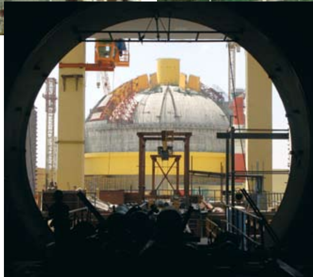
A fast-breeder test reactor at India's Kalpakkam Nuclear Complex.

But if one looks at the situation very precisely—and we have demonstrated this