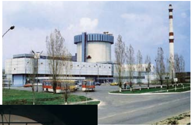
The Novovoronezh nuclear plant in Russia.

of Latin America, of most of Asia, then the industrial potential these countries have so far is not sufficient to solve this crisis. And therefore, we need America, we need Europe, and we need, above all, Germany. Because Germany was once the people of poets, thinkers, and inventors, and we still have the know-how which these countries urgently, urgently, urgently need, and which is the only way out of this crisis.