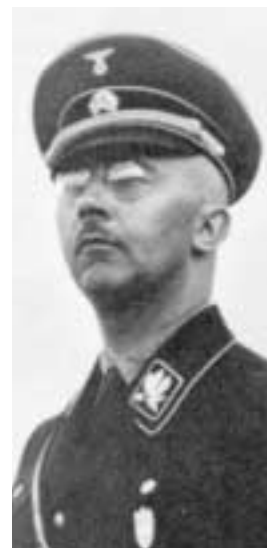
Joseph Lieberman and Lynne Cheney are leading a witch-hunt against Arab and Muslim intellectuals—or against anybody who defies the official line on 9/11—in the evil tradition of Sen. Joe McCarthy and Nazi SS Chief Heinrich Himmler.