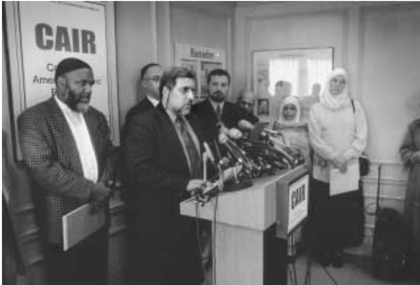
A press conference by the Committee on American Islamic Relations (CAIR), in March 2002, protested the Justice Department raids on homes and businesses of Arab-Americans, including the International Institute of Islamic Thought in Herndon, Virginia. Those raids were just the beginning of what Lieberman, Cheney, et al. have in mind to further the Clash of Civilizations.