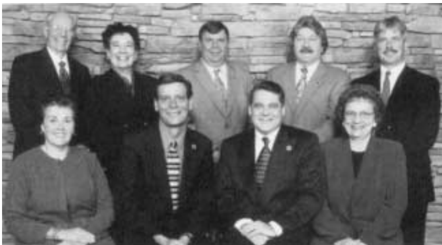
The "Tribal Council Management Board" of the Mohegan tribe which appears to have been created to site the casino.

one town official suggested that the Mashantucket Pequots were not really an Indian tribe at all. He was told that McCain and other leaders of the Indian casino cause would not appreciate that point. But the local leaders were advised to continue fighting in the courts against casino expansion. Lieberman soothed them, "If you fail at the appellate court, I think it would be an appropriate time to have Congress address this issue." He concluded the meeting by assuring them: "I understand your concerns and understand we haven't given you answers to the questions you've been raising. But we will."