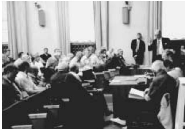
Lyndon LaRouche speaking to Russian Academy of Sciences in June 2001; a demonstration of catenary curves in LaRouche's newspaper, New Federalist. Dr. Enéas asks, "What Presidential candidate in Brazil, or in the United States, for that matter, has ever heard of a catenary? . . . None of them . . . has the slightest idea of the importance of scientific knowledge to the statesman who would lead a nation."

Mr. LaRouche has been insisting for decades, and I have been repeating here in Brazil since 1989, the crisis is systemic.