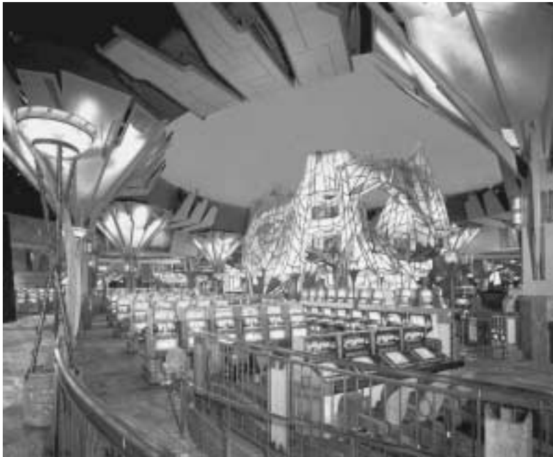
One-armed bandits by the hundreds line up in front of the garish center of the world's second-largest casino, the Mohegan Sun in Uncasville, Connecticut, set up with the support of "conscience of the Senate" Joe Lieberman. Lieberman's and the world's largest casino, Foxwoods, is just across the Thames River at North Stonington, Conn.

hell was unleashed in his state. FEC records show that during the 1994 campaign cycle, Lieberman received: