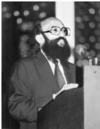
Dr. Enéas Carneiro, three times Presidential candidate in the past, has stunned IMF backers with his overwhelming Congressional victory, which elicited from AP the hilarious headline, "Fringe Candidate Sweeps Election."

From his first election bid in 1989, his trademark became "My name is Enéas," the concluding words of the 17 seconds in free national television time allotted him as a minor Presi-