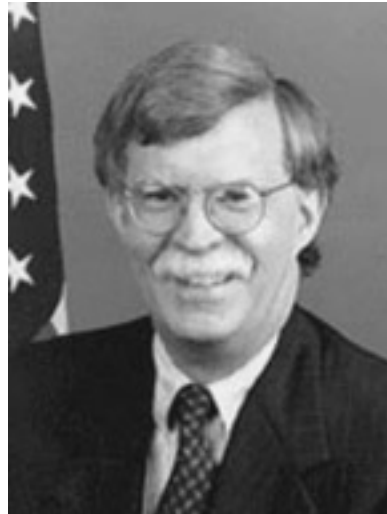
Asian stabilization moves were given greater urgency after U.S. State Department "chicken hawk" John Bolton went to Seoul on Aug. 28 to repeat the "axis of evil" charge and call for regime change in North Korea.

Koizumi's trip to North Korea "was coordinated with Russia and China, who also gave North Korea very strong commitments for big money to rebuild the lines and their economy," the Korean said. "For that reason I expect something concrete to happen within the next few months"