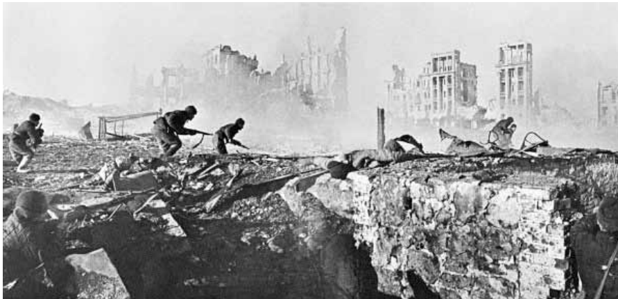
Red Army troops fighting amidst the ruins of Stalingrad during World War II.

I have already mentioned that we Russians are extremely sensitive to everything related to our sovereignty and independence. We love our country, our previous generations. Our ancestors had to defend our land many, many times from foreign invaders, and we remember very well all our heroes, especially the huge sacrifices in the Second World War.