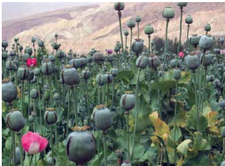
A poppy field in Afghanistan.

Amb. Khovaev: The most dangerous drug. They are producing in various regions. For your information, when the Soviet Army was in Afghanistan in the 1980s,