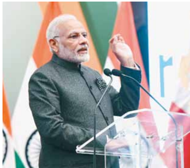
Narendra Modi, Prime Minister of India, addressing a reception for the Indian community in Philippines, in Manila on November 13, 2017.

The other leader committed to this is Prime Minister Narendra Modi of India, which means you have Russia, China and India. The only big country,