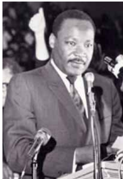
Dr. Martin Luther King, Jr. in Memphis, Tennessee on April 3, 1968.