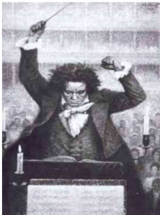
Ludwig van Beethoven (1770-1827)

When he was asked by CBS reporter Daniel Schorr, “Senator, what do you make of the problem of poverty in this poorest state?”, a deeply affected Kennedy, after a pause, replied, “Well, I think it’s obviously as great a poverty as we’ve had in our country, and I think that considering we have a gross national product of some $700 billion and that we spend $75 billion on armaments and weapons, and that we spend almost $3 billion a year on dogs in the United States, as American