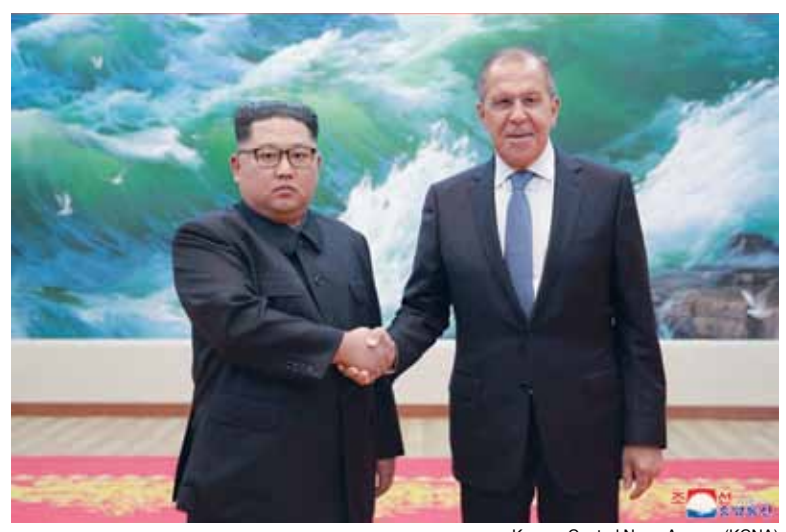
Korean Central News Agency (KCNA)

I think it's very important that, with the New Silk