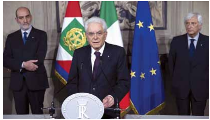
Palazzo del Quirinale

Helga Zepp-LaRouche: Yes. It is a dramatic situation. The President of Italy, Sergio Matarella, has refused a government proposed by a majorityelected coalition of the Lega party and the Five Star Movement party because