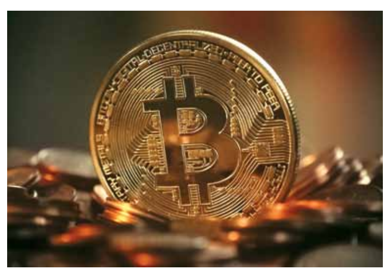
A bitcoin token.

I think it just requires a continuation of our mobilization. I know our colleagues in the United States from LaRouche PAC have produced a new pamphlet with the demand implementing the Four Laws of my husband, Lyndon LaRouche, and showing why the United States must join with China in building the New Silk Road, both domestically and internationally. This pamphlet, "LaRouche's Four Laws & America's Future on the New Silk Road," is out. I would encourage you, our viewers and listeners, to get hold of this document: Read it, because it has all the solutions—the correct economic conceptions for the United States and the rest of the world to get out of this present crisis.