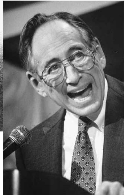
“Third Wave” cultists (left to right) Newt Gingrich, François Quesnay, and Alvin Toffler. Quesnay’s doctrine that “bounty” inheres in the feudalist form of property title to the land, forms the kernel of what became Gingrich’s “Contract on America” manifesto.

could disagree today. Similarly, glassy-eyed advocates of “globalization,” insist on defending the delusion, that the present, ever-deeper lowering of average physical-economic output per-capita, globally, must be continued, as a general benefit to not only the U.S., but also the world economy. Apparently, such advocates have not mastered even the simplest operations of addition and subtraction.