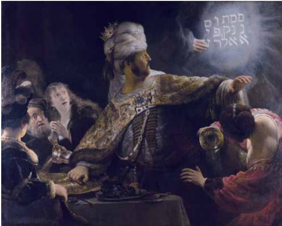
Rembrandt van Rijn, "Belshazzar Sees the Handwriting on the Wall" (c. 1636).

pravity which was characteristic of Georgian England from the time of the South Sea Island and John Law bubbles, the depravity which Hogarth depicts in his The Rake's Progress .