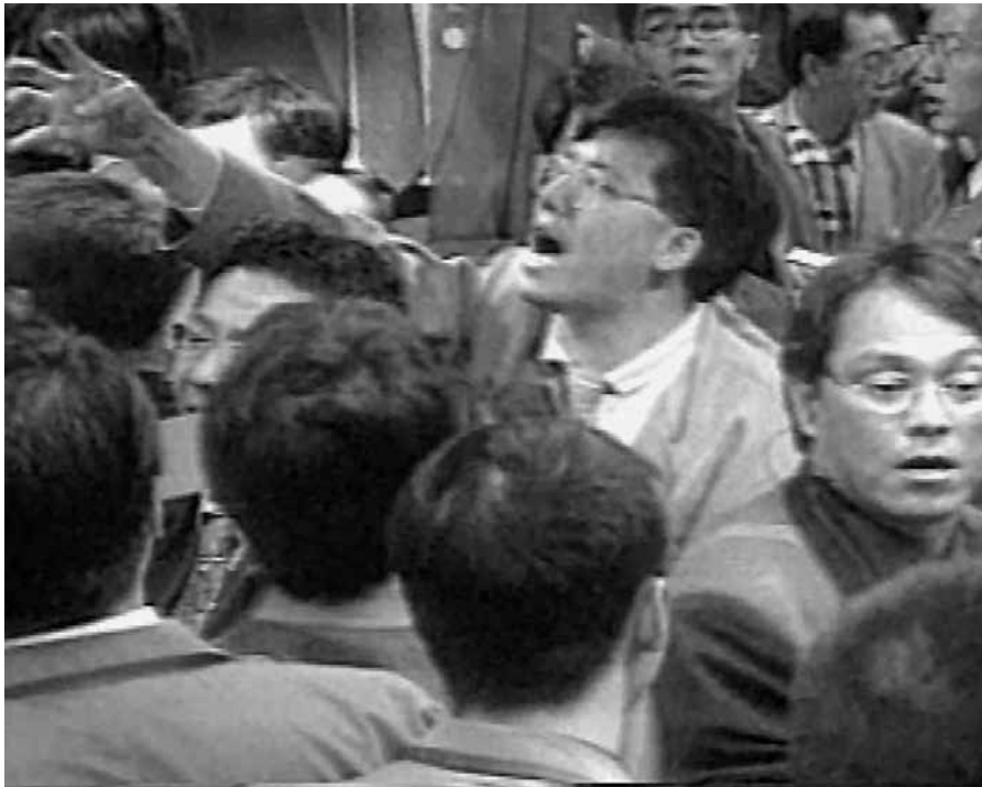
Indonesian currency traders, 1998. "What menaces us today, is far worse than some passing, crazy fad," LaRouche writes. The younger generation in Japan, and elsewhere, typifies a ruling stratum, like Babylon's Belshazzar; "whose role today is that of a caste which lacks the moral fitness to survive."

mann: that pathological, "Third Wave" style in mathematical thinking, which dominates the circles presently engaged in bankrupting the world's present global financial and monetary systems. That lunatic variety of mathematics represents the more obvious cases; but, as we have already stressed, to discover the corruption which led to Wall Street's tolerance for John von Neumann's "chaos theory" and similar cults, we must focus upon the susceptibility which is the outgrowth of a certain aspect of a certain, centuries-long current of modern European thinking about mathematics.