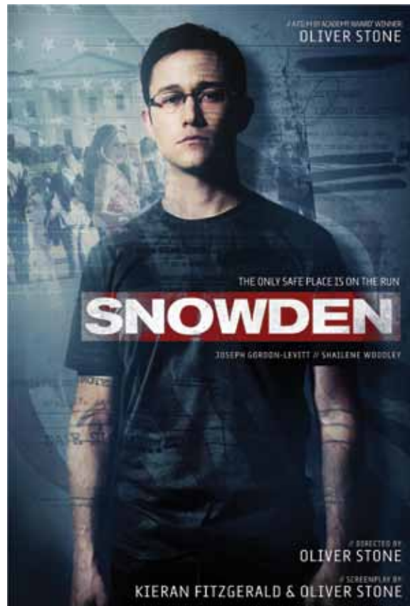
A poster for the movie Snowden, directed by Oliver Stone.

Snowden's background, as shown in the film, was as a deeply patriotic individual who wished to serve his country. He personally revolted against what he recognized as a criminal use of these programs during the Bush/Cheney years, but he stuck with the system when Obama, in his campaign speeches in 2008, pledged to end it. Only when it was clear that Obama had lied and was going even further than Bush, did Snowden decide he had to act on his own.