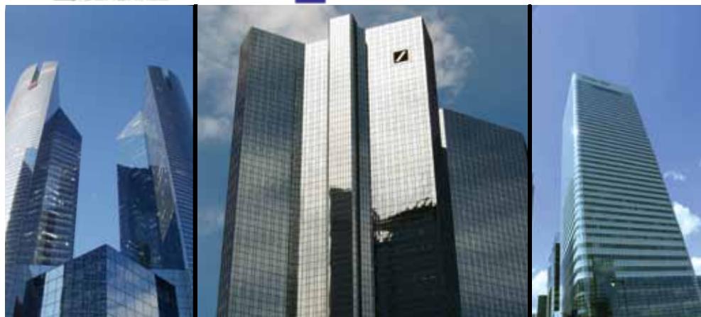
The headquarters of some European Banks towering far too high for the level of their risky assets.

in the harshest terms, and announced an escalation of their campaign for justice.