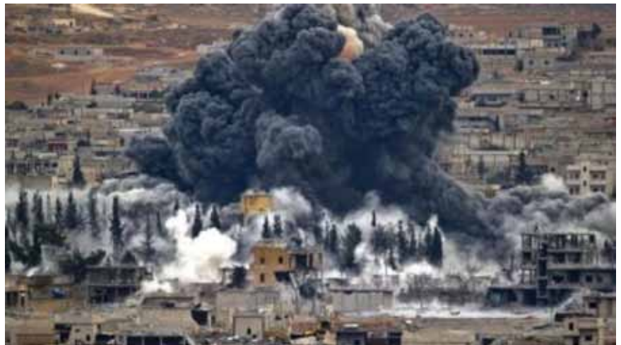
Deir al-Zour, where a U.S.-led strike killed up to 80 Syrian government soldiers.