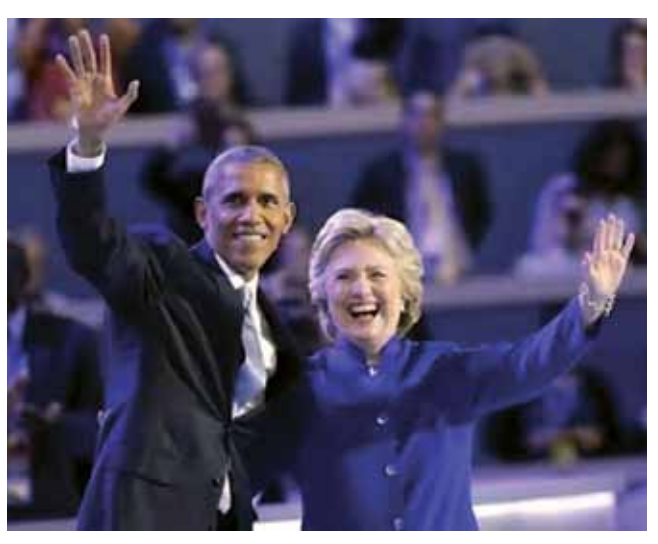
What did we get? Hillary Clinton became an agent of Obama, and Obama was actually the leading figure of Satan around the world

He was framed up, and a sex charge was put against him. What had happened is that he had moved to prevent a crisis in German policy and Russia policy as