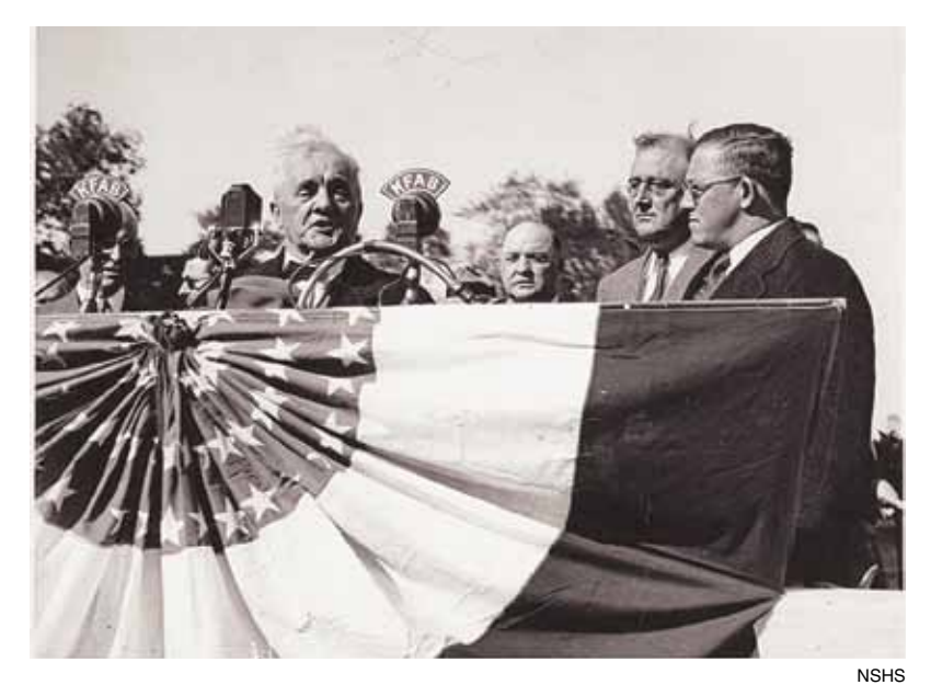
Bipartisan collaboration for the nation: Republican Nebraska Sen. George Norris, a key promoter of the TVA, campaigns for FDR's re-election campaign in 1936.

That's our problem; Wall Street is what makes us prisoners. And the British give the orders, and Wall