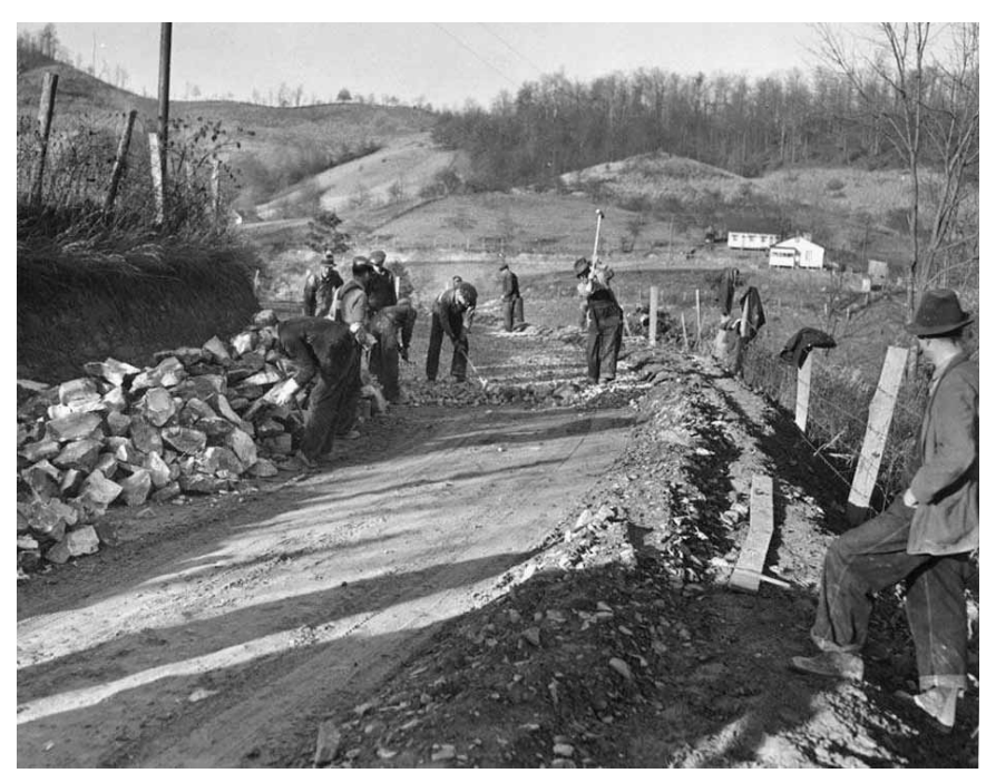
U.S. National Archives and Records Administration