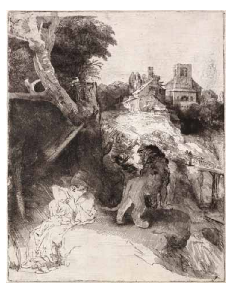
"Saint Jerome Reading in an Italian Landscape," by Rembrandt Harmensz van Rijn, an etching done in 1653.

The power of creativity, for example, the discovery by Kepler of the Solar System: Kepler, by himself, was the genius who discovered the principle of the Solar System. Implicitly the same thing is extended to a higher level, the Galactic System. For example, most of the water that mankind depends upon depends upon the Galaxy, not an inferior system. So that when we operate in this way with true physical science, with the greatest scientists, and all greatest scientists show these charac-