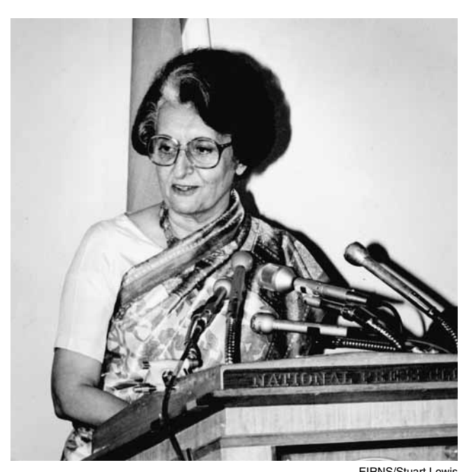
The world was deprived of excellent global leadership when Indian Prime Minister Indira Gandhi was assassinated in 1984. Here she speaks at the National Press Club in Washington on July 30, 1982.